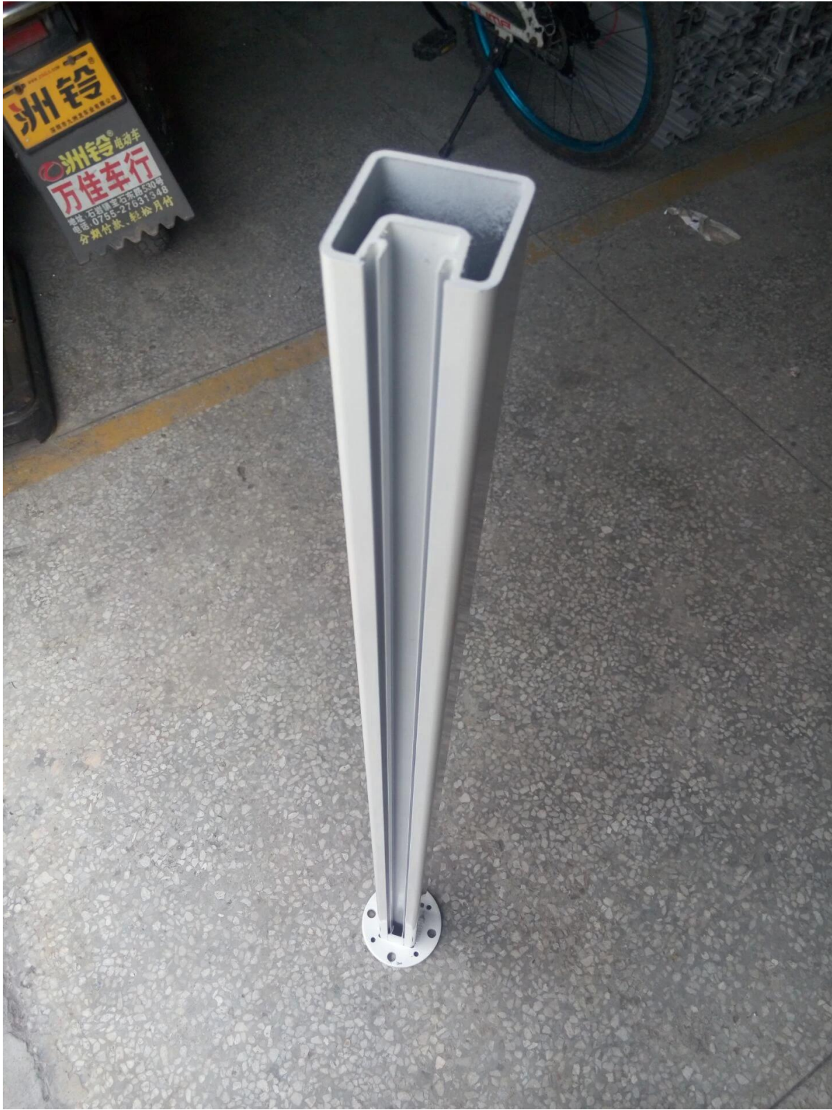
square custom black fence aluminum post,