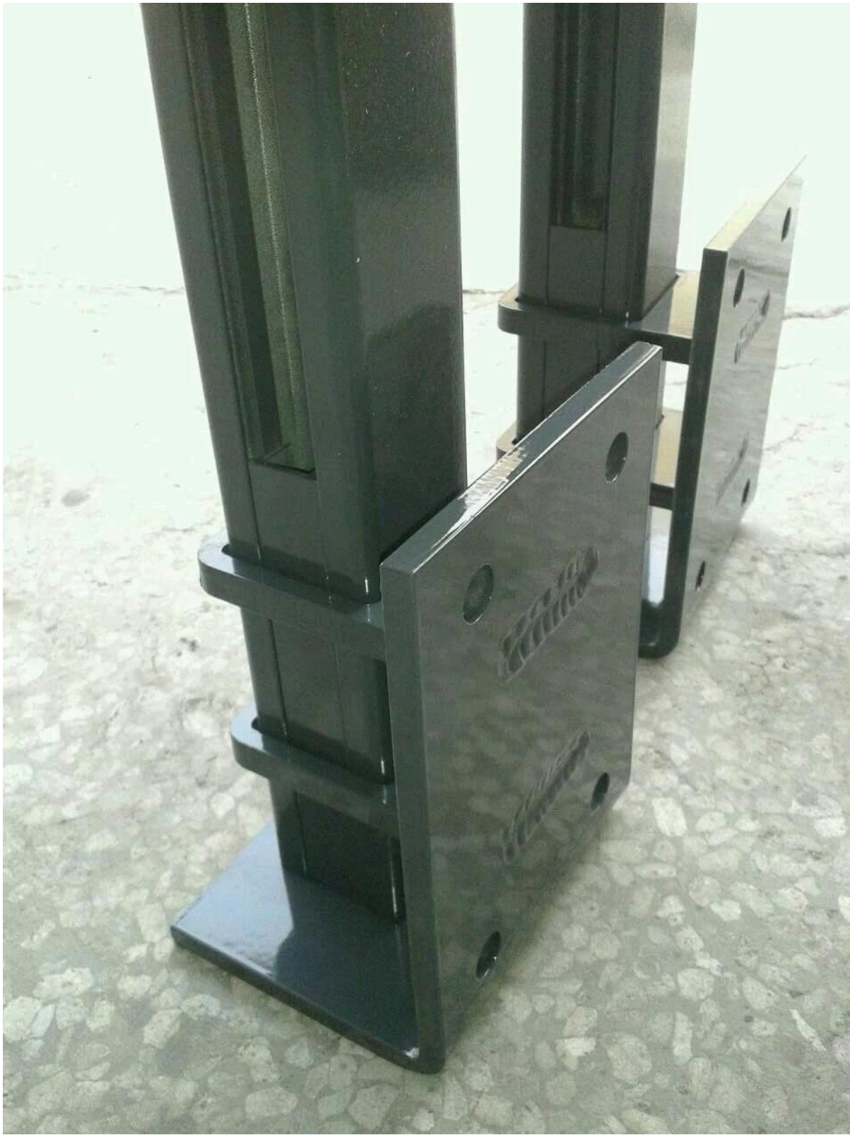
4. Aluminum profile handrail and post packing photo , Aluminum post ,