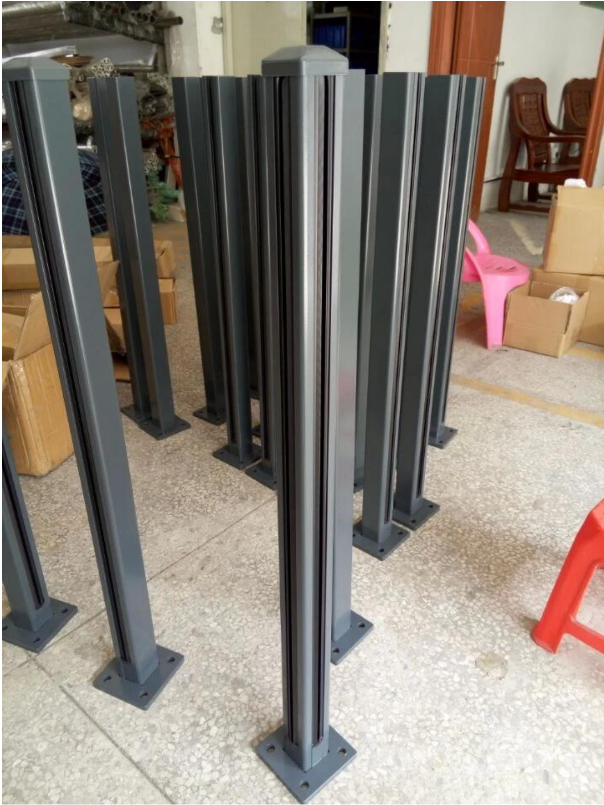
Aluminum handrail post balcony , pool fence glass railing project for your reference ,