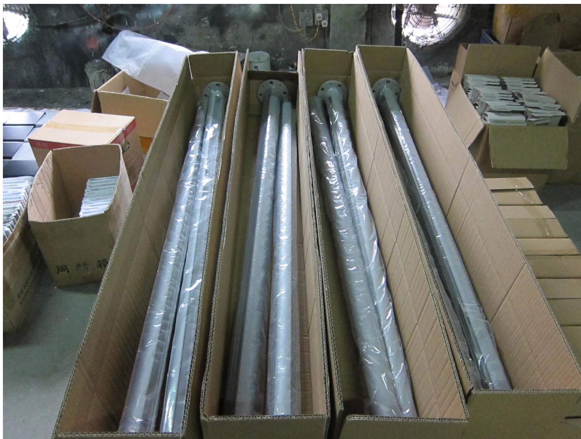
Aluminum handrail ,