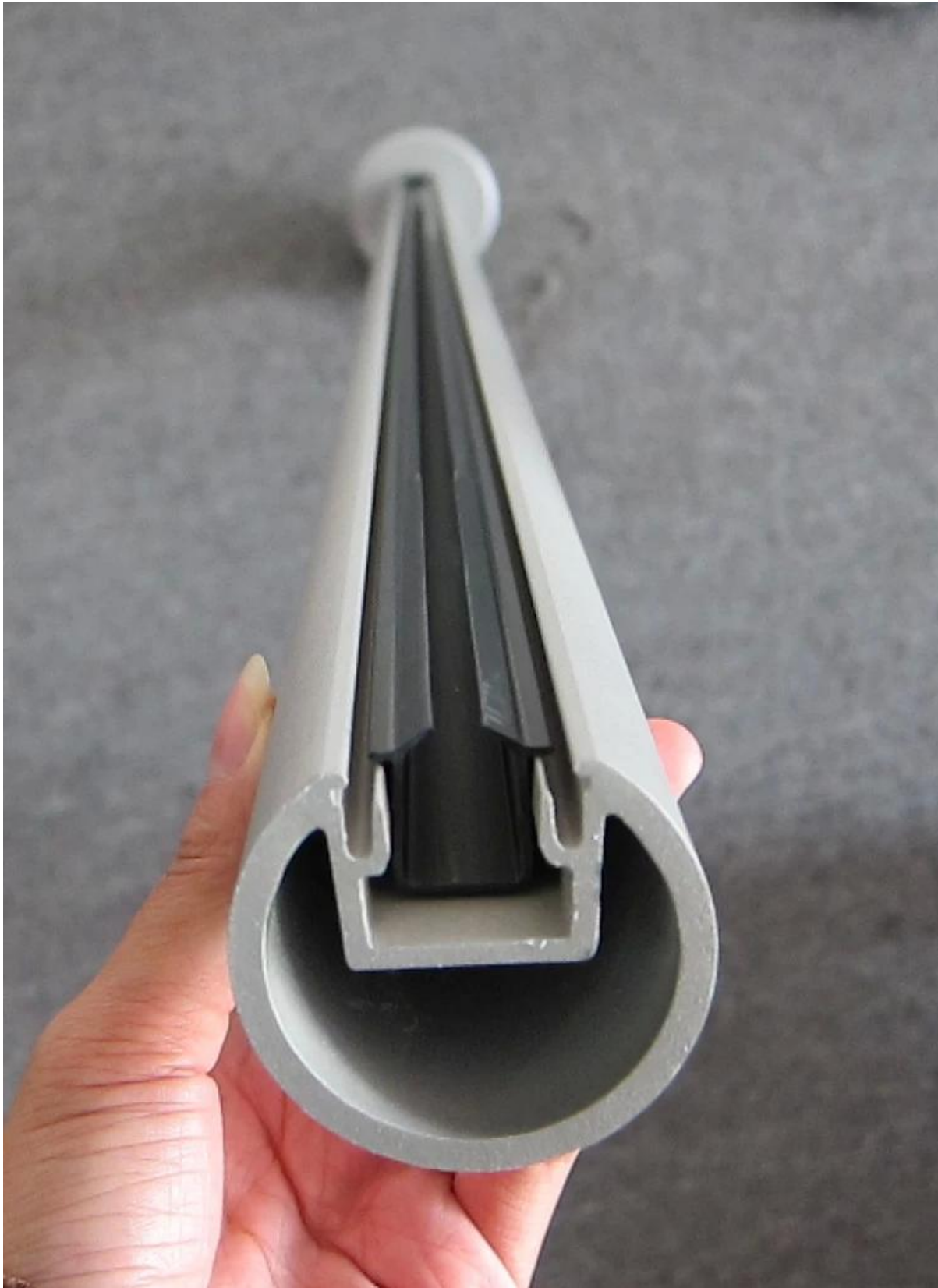
Aluminum handrail post balcony , staircase glass railing project for your reference ,