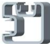
Square 2 way 90 degree