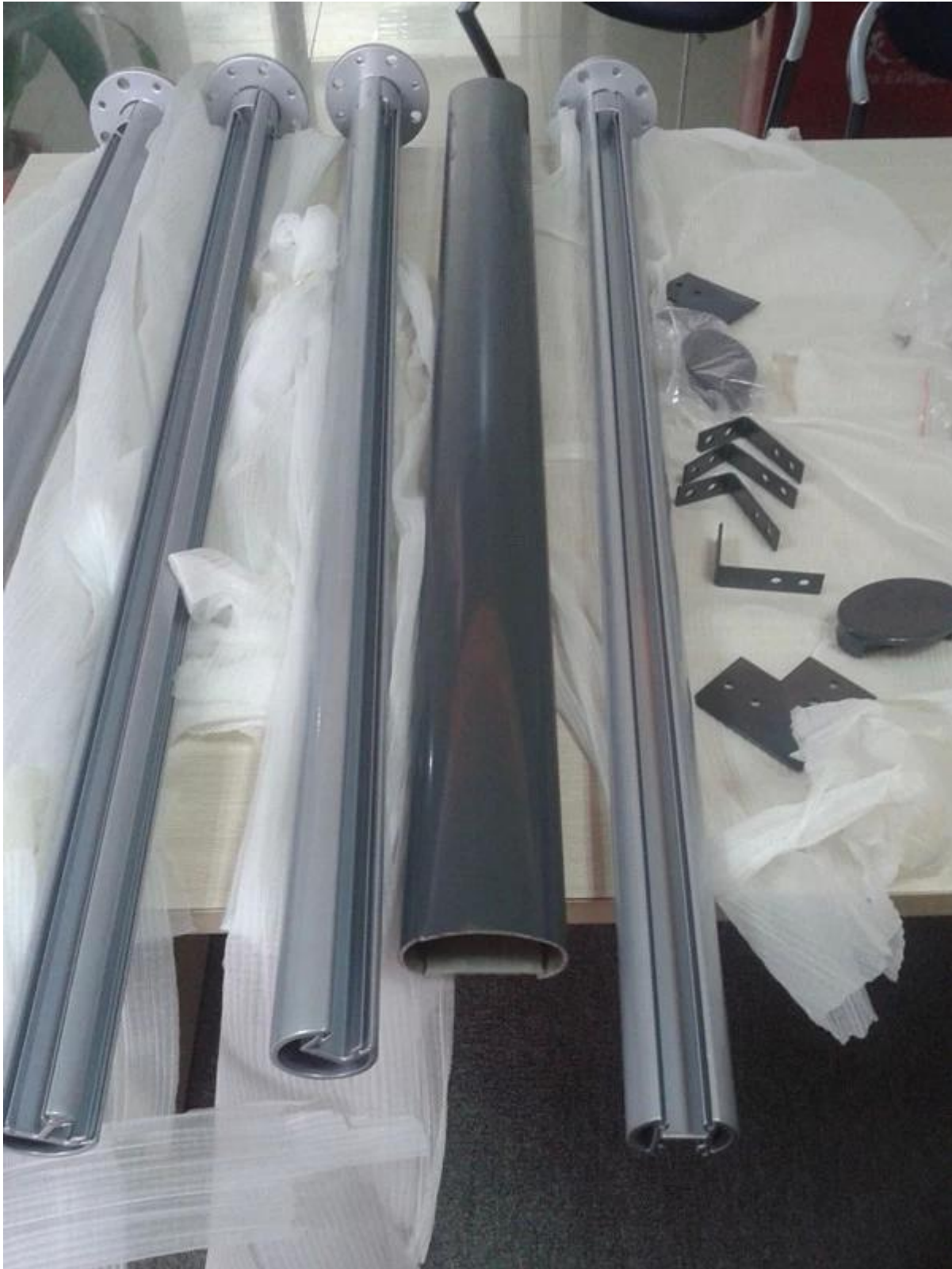
4. powder coating 6063 T5 aluminium profile for glass railing: