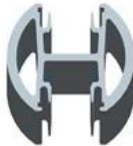
Round 2 way 180 degree