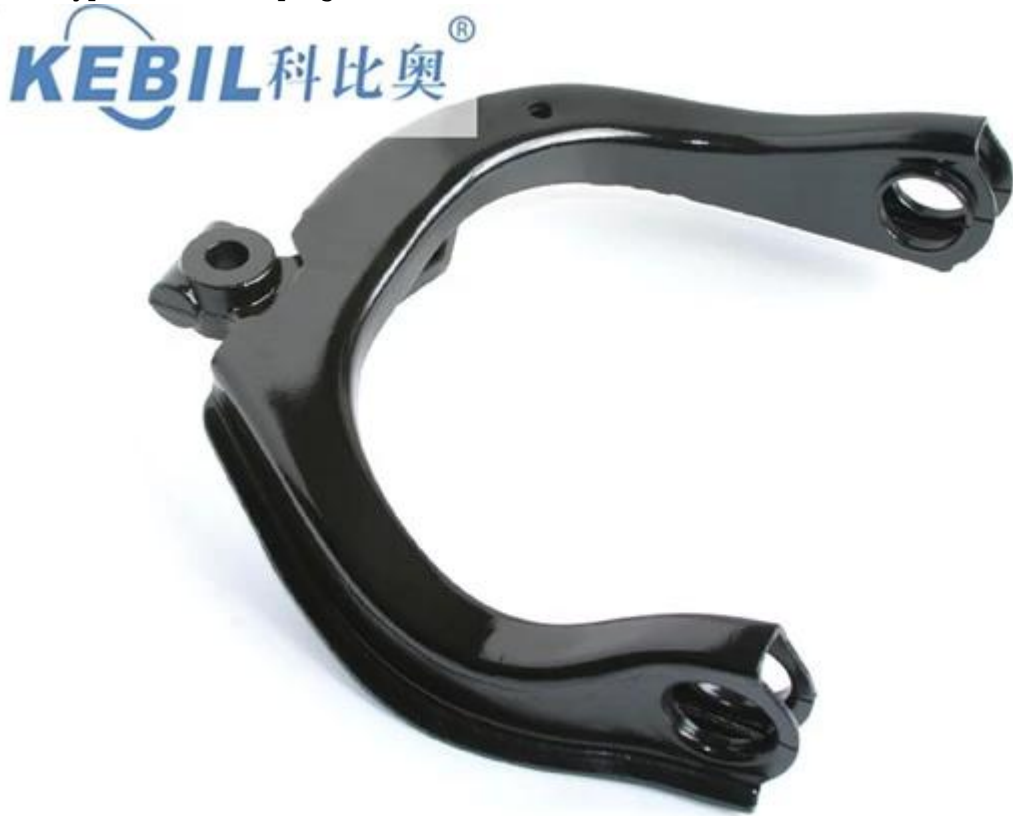
prototype metal stamping