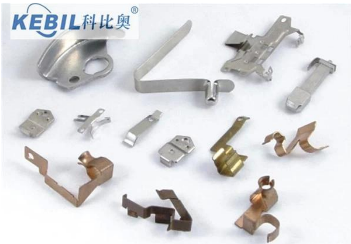
prototype metal stamping