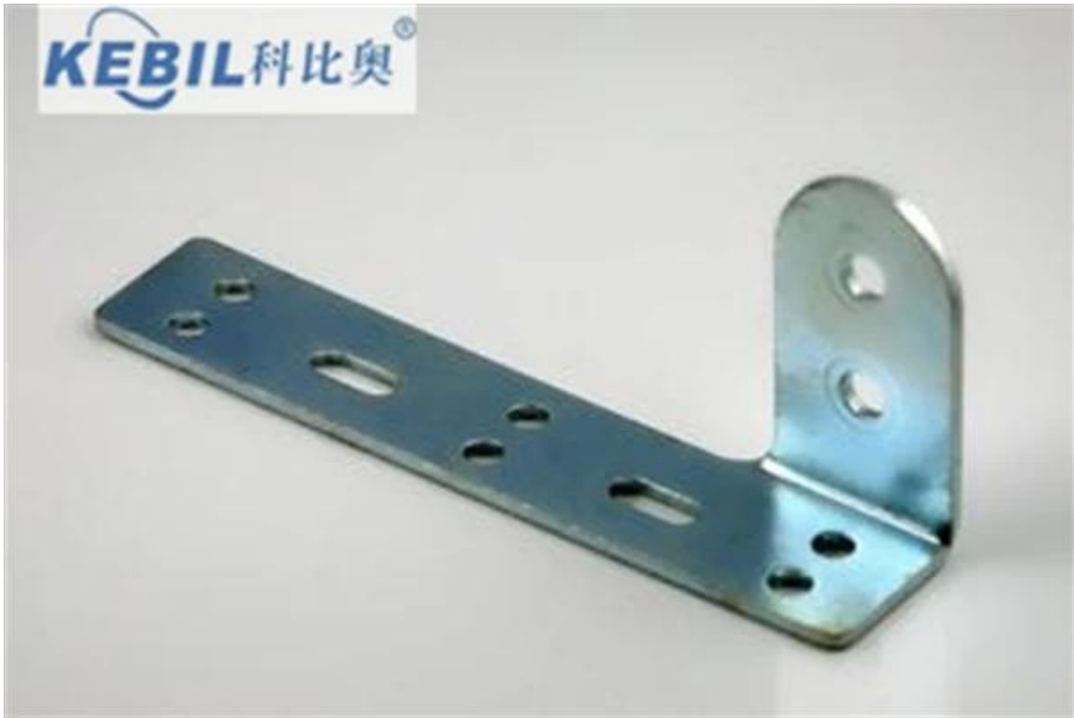
prototype metal stamping