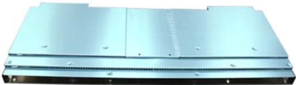
prototype metal stamping