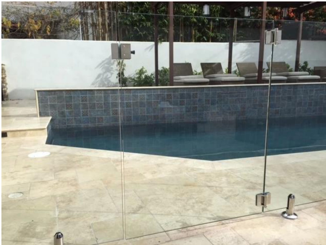
other glass railing hardware: glass latch