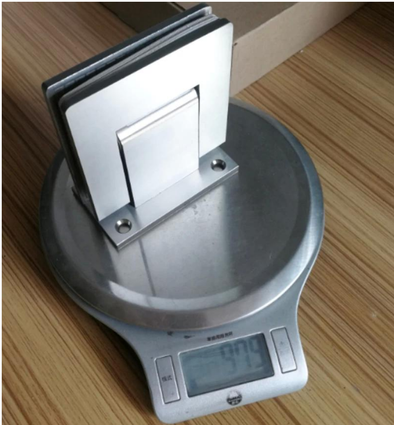
90 degree & 180 degree glass door hinge with stainless steel material -