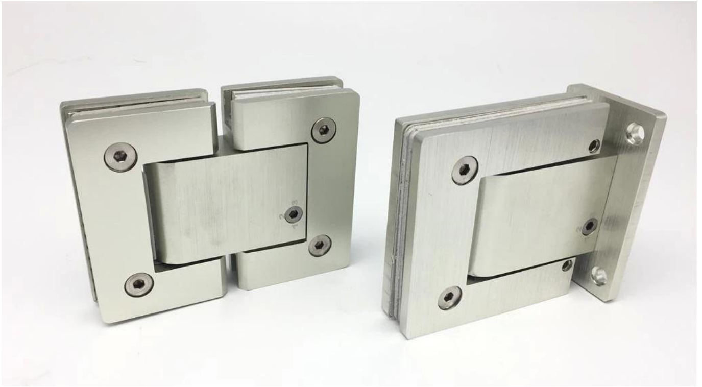
90 degree glass door hinge (stainless steel material & aluminum material) -