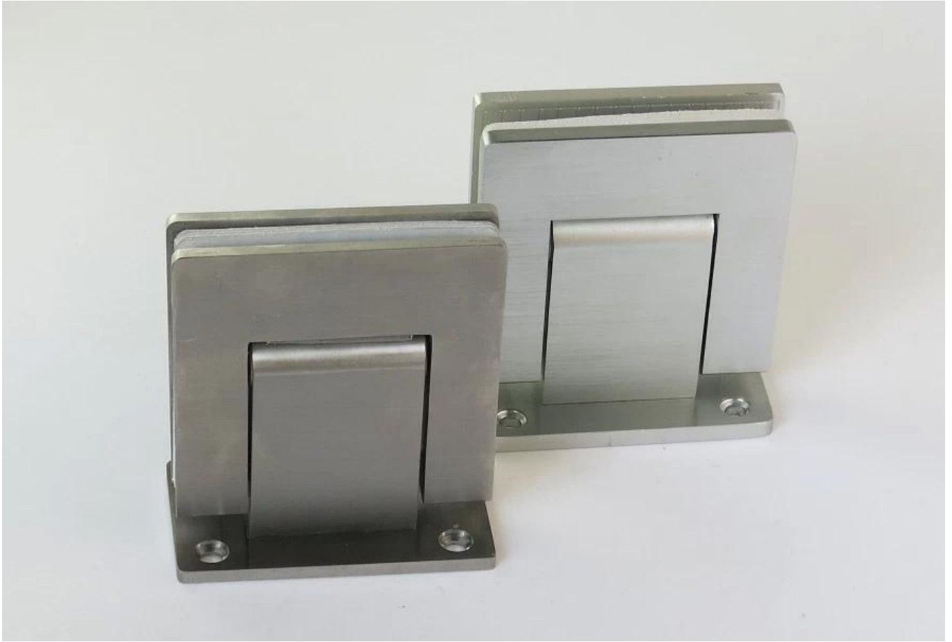
How to install glass door hinge ?