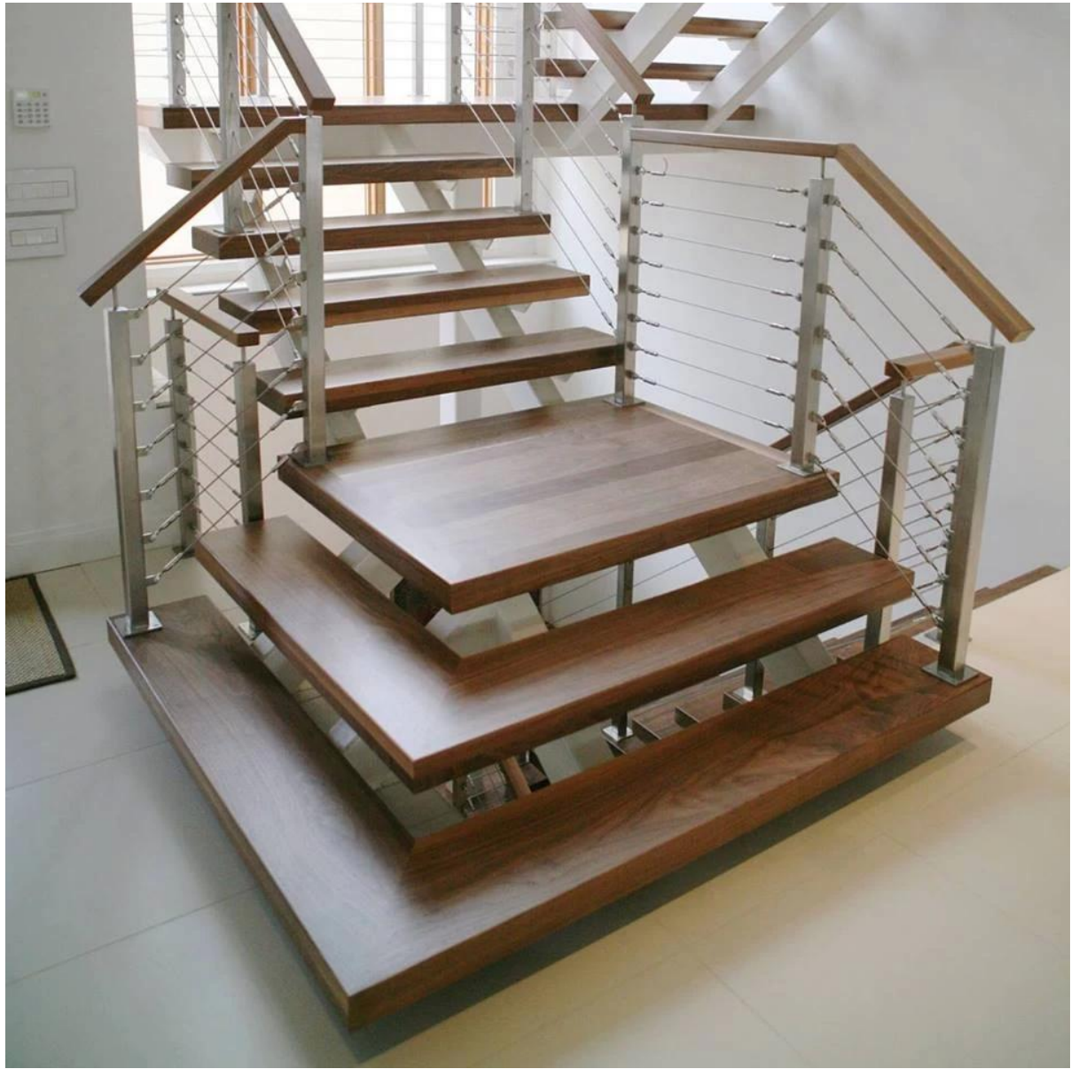
with round stainless steel handrail outdoor