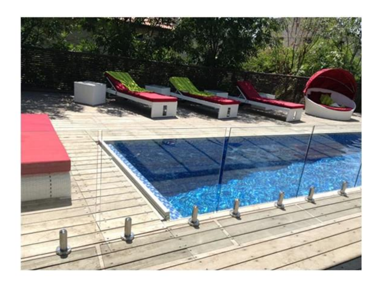
frameless glass balustrade