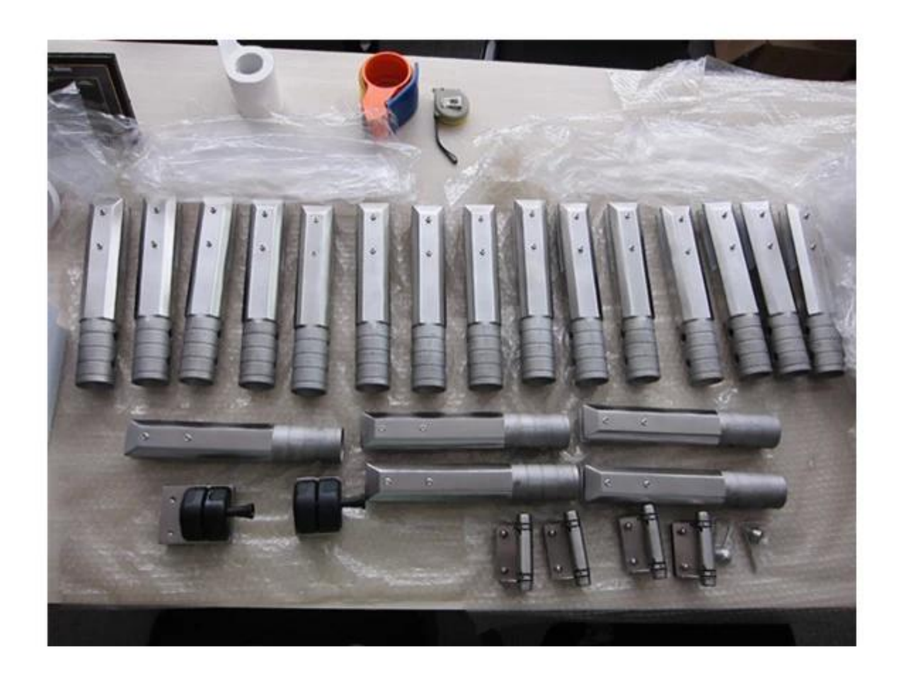
square glass spigot