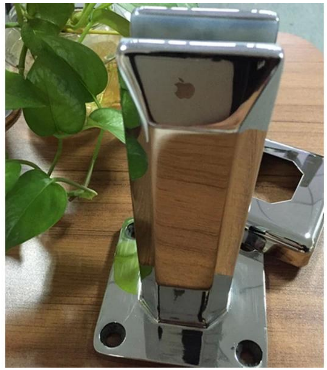
3.core drill glass spigot in round and square shape, satin finish