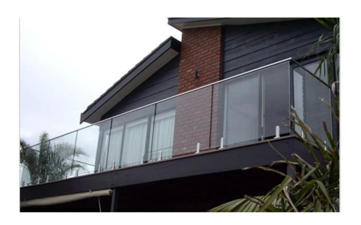
mini top rail and glass spigot