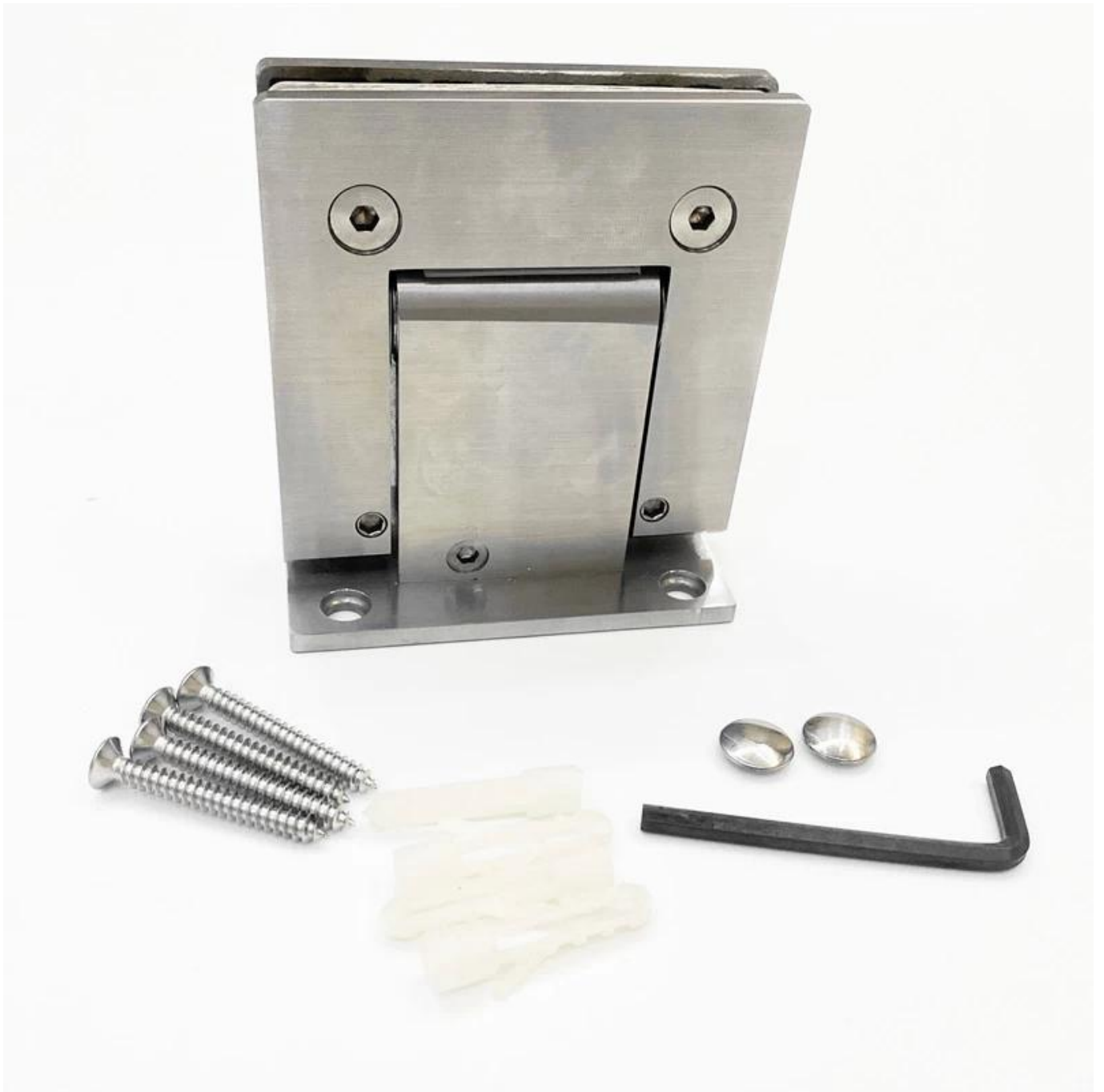
Installation instructions of soft closing Shower door glass hinge -