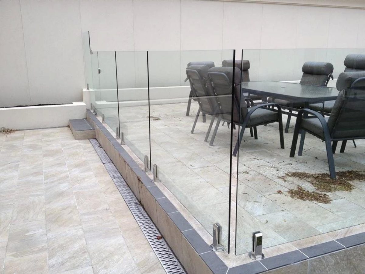
Strength test report