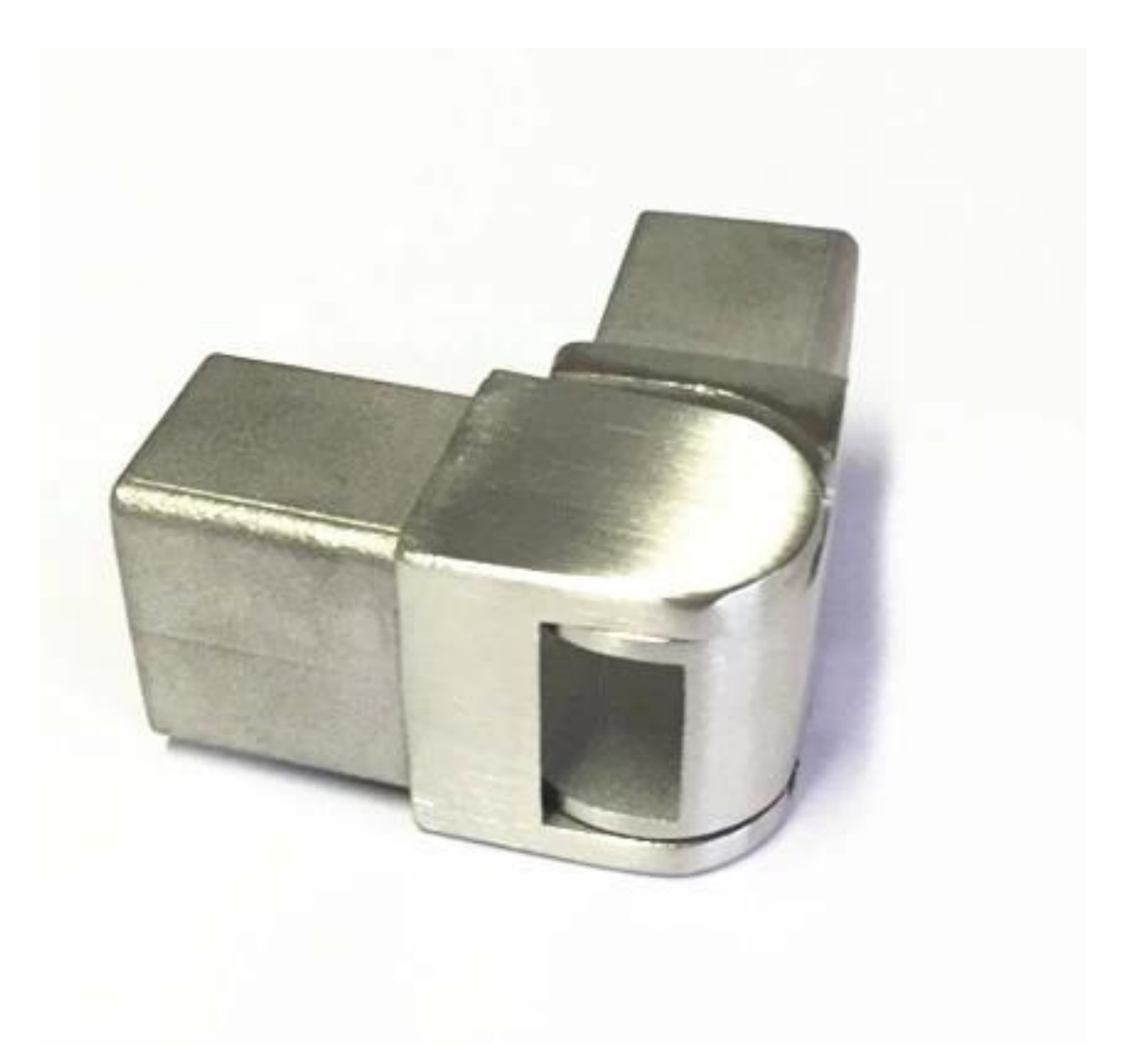
2. Up + Down adjustable joint