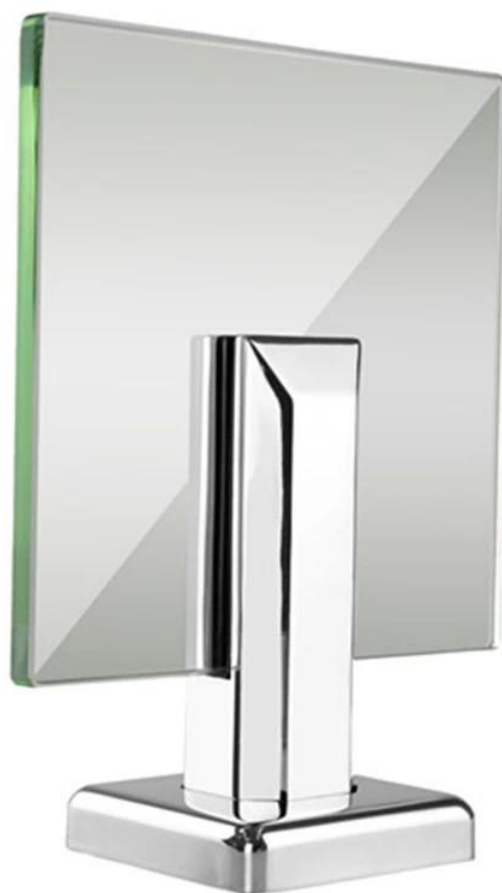
round base plate glass spigot-