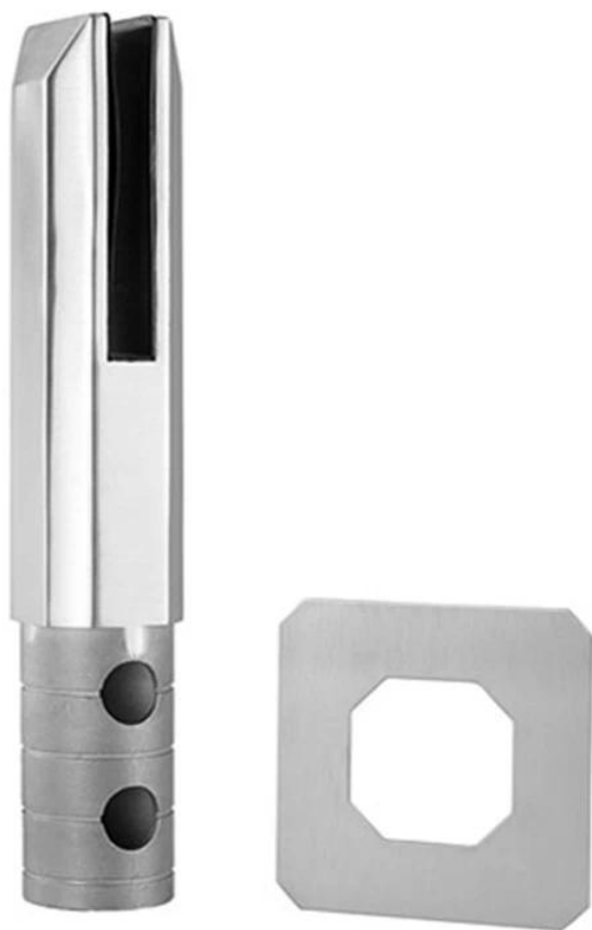
round core drill glass spigot-