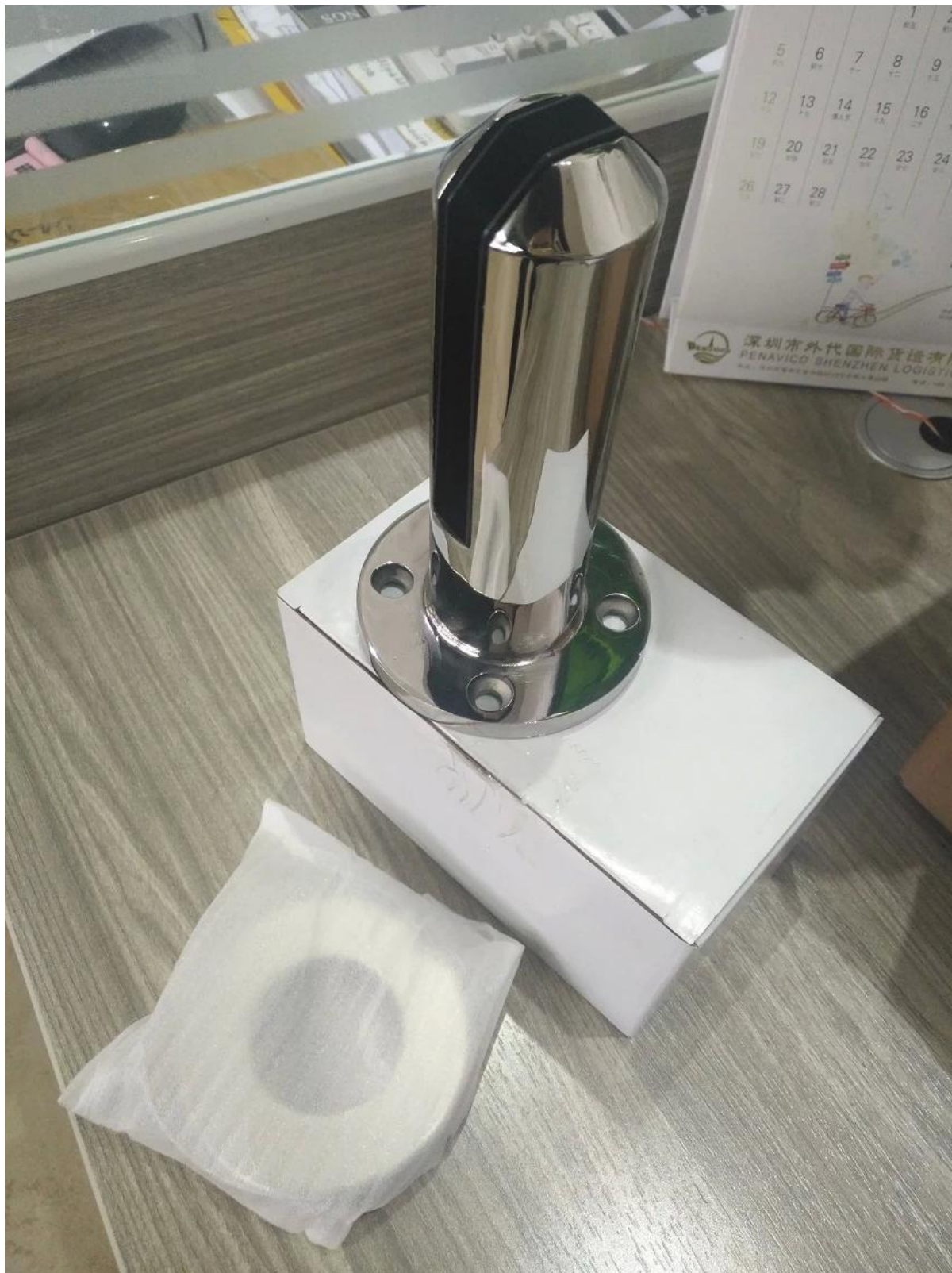
3. Glass spigot project for your reference ,