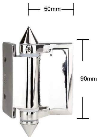
Part # G-W