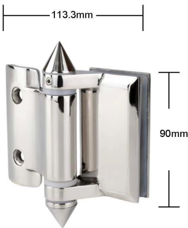
Part # G-R