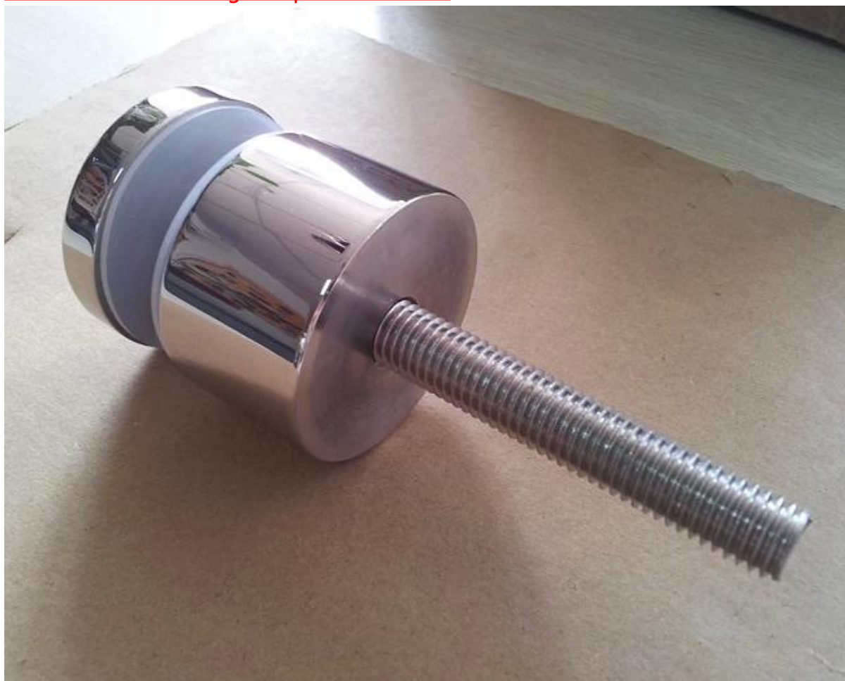
3. Model No. SF-50T glass panel holder .