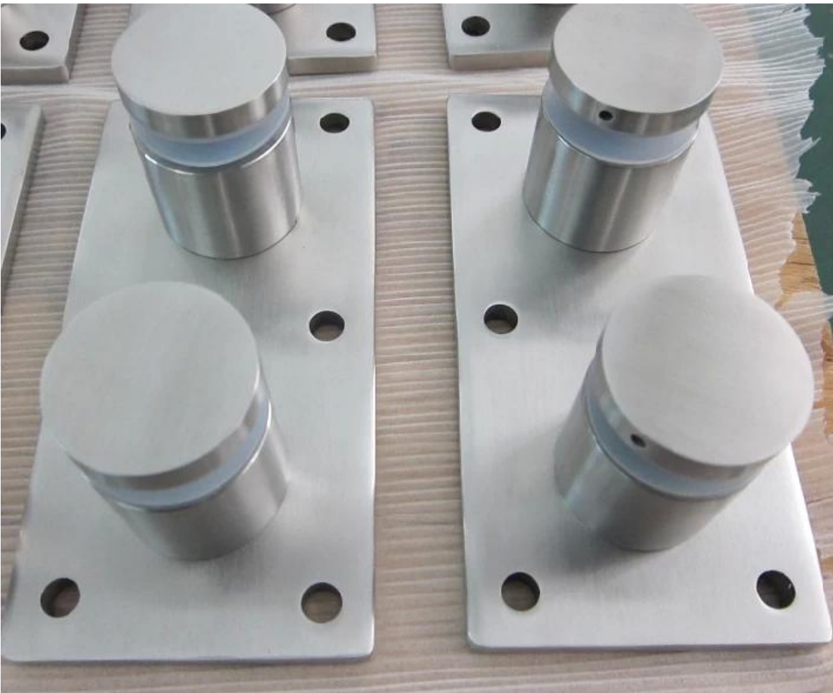
4. stainless steel 316 marine grade standoff glass panel holder glass fastener hardware project photos: