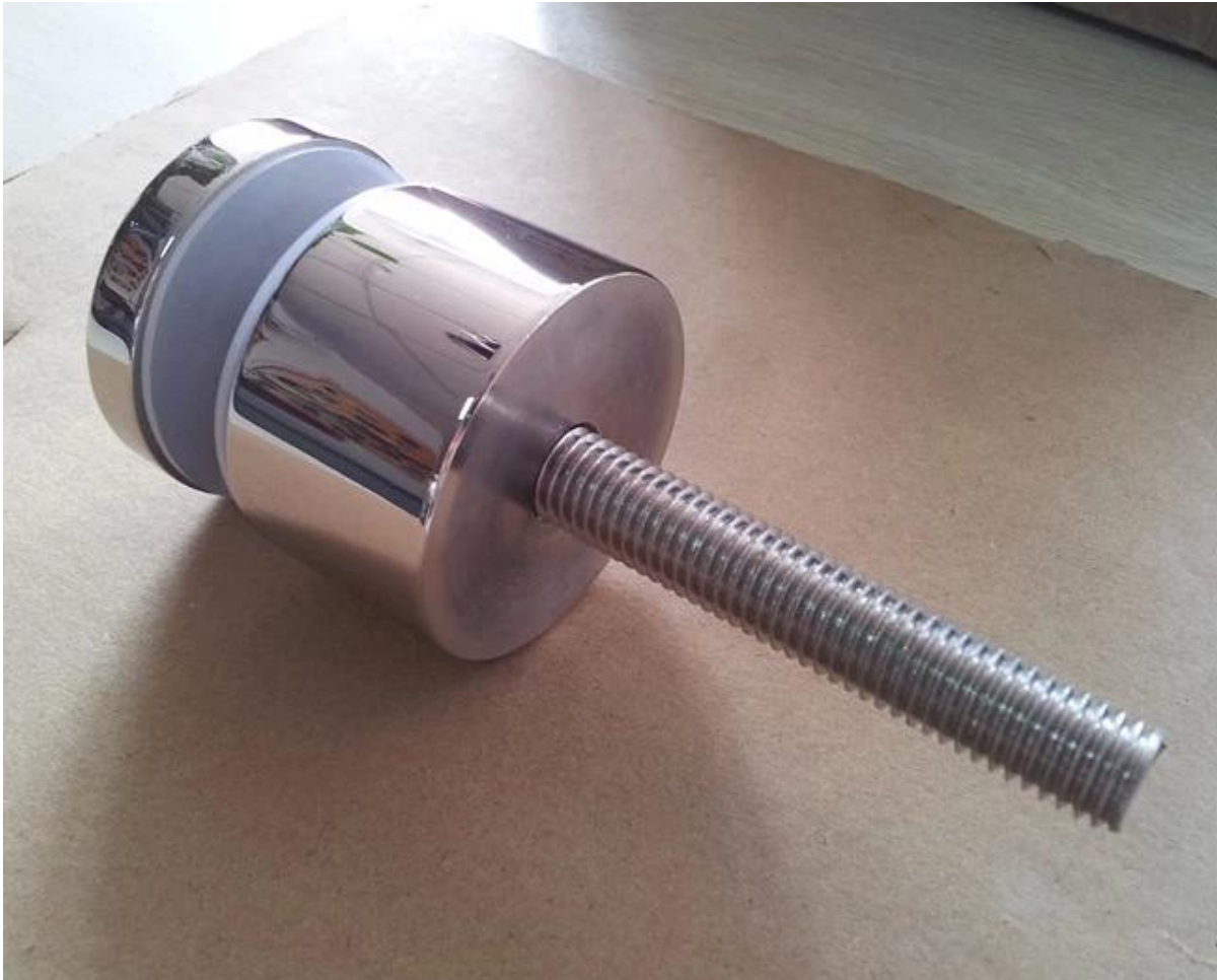
3). Model No. SF-50T glass panel holder standoff.