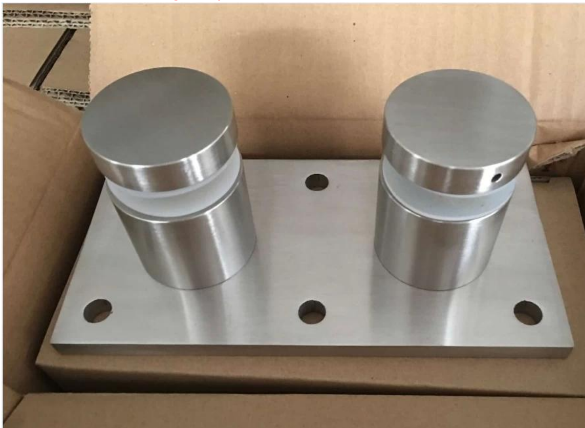
3. stainless steel 316 marine grade standoff glass railing system project for your reference: