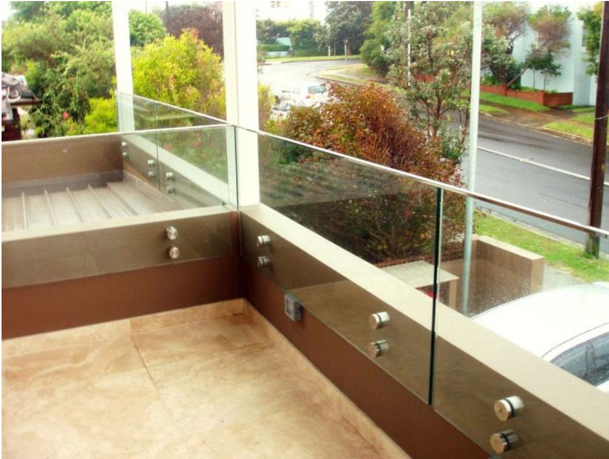
2). standoff glass railing system indoor staircase design