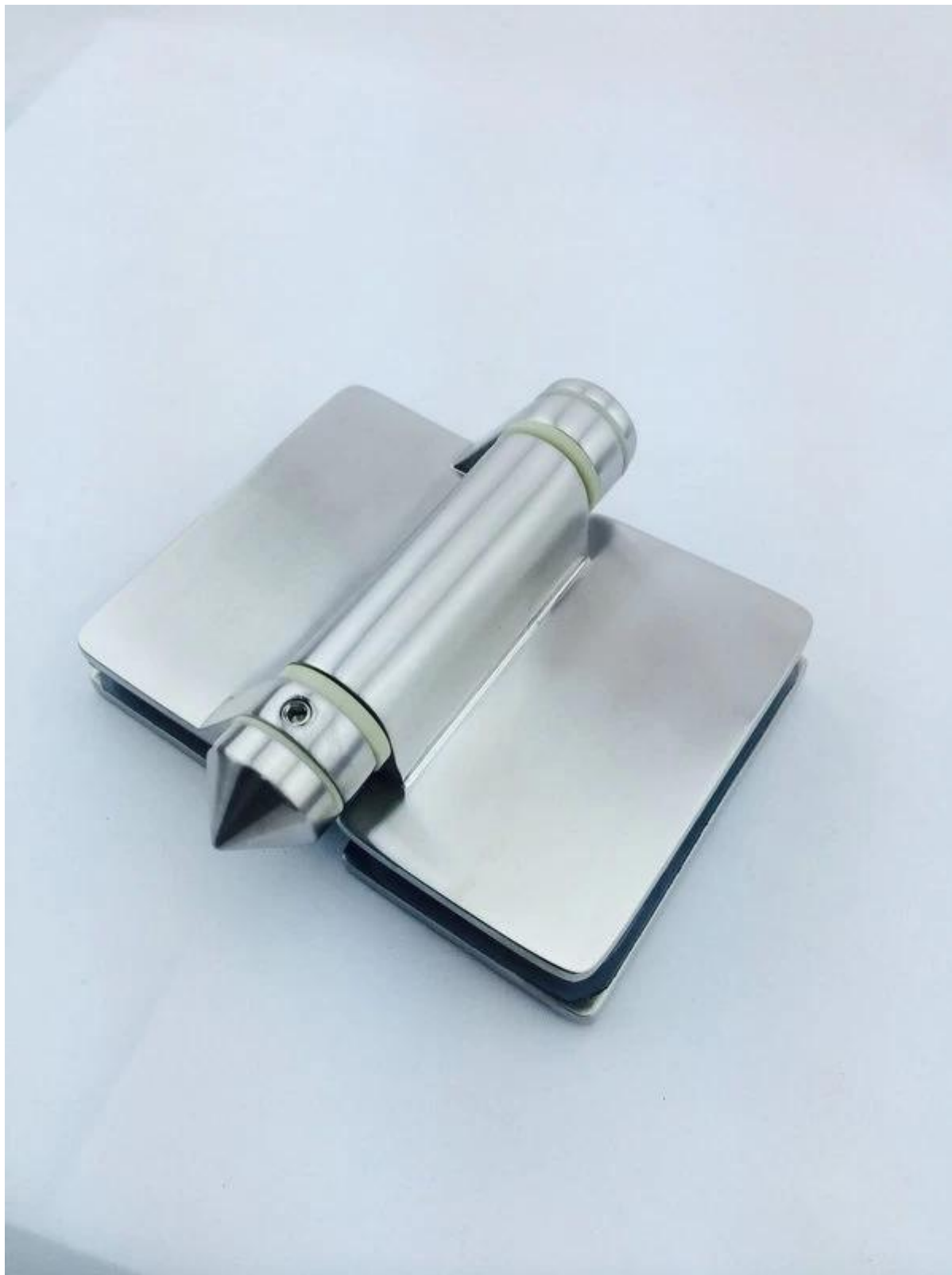
G-G2 glass door hinge, mirror polished, with chamfered edge; Click the picture for more information: