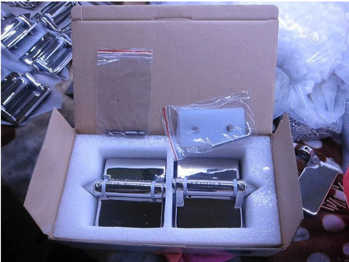
Spring loaded, self-closing glass to glass door hinge, made by casting.