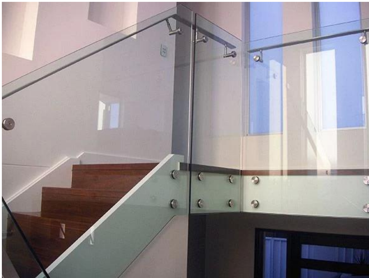
3).stainless steel 316 standoff glass support brackets glass fastener hardware indoor corridor glass railing design