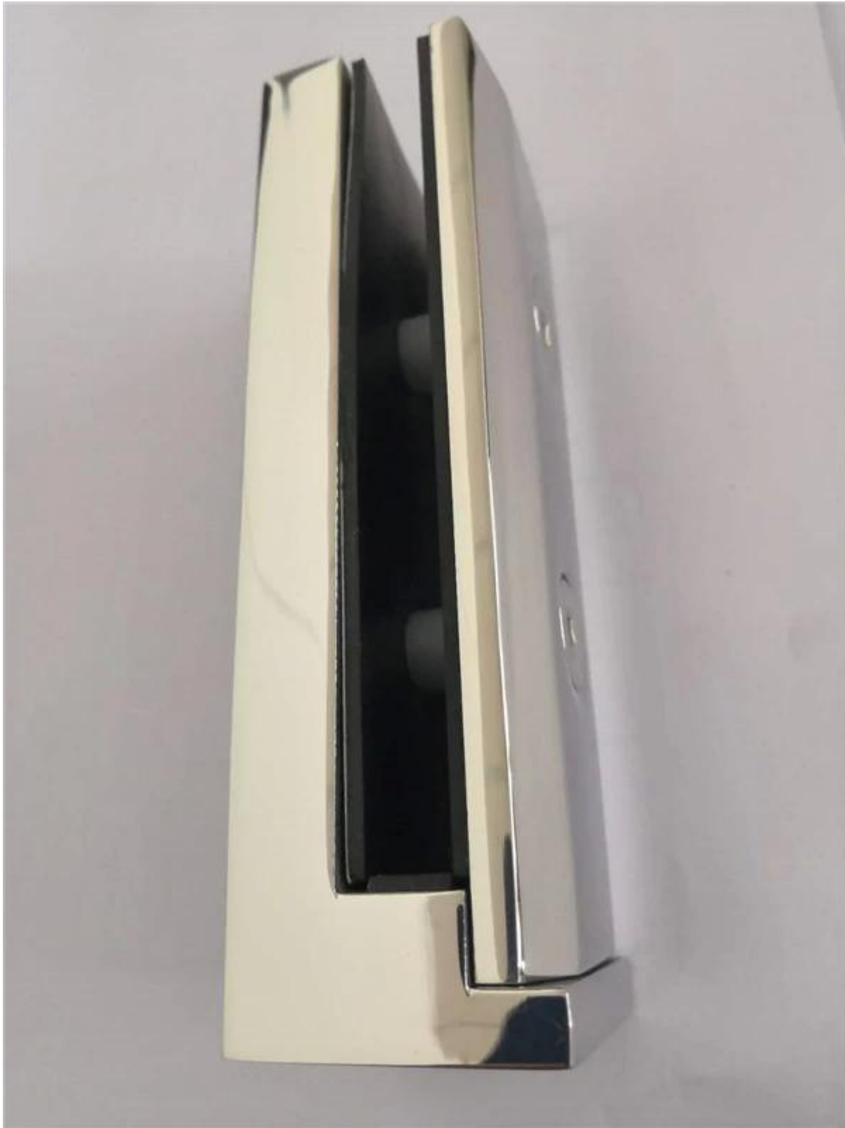
# Drawing of Stainless steel Side Mounted Glass Spigot-