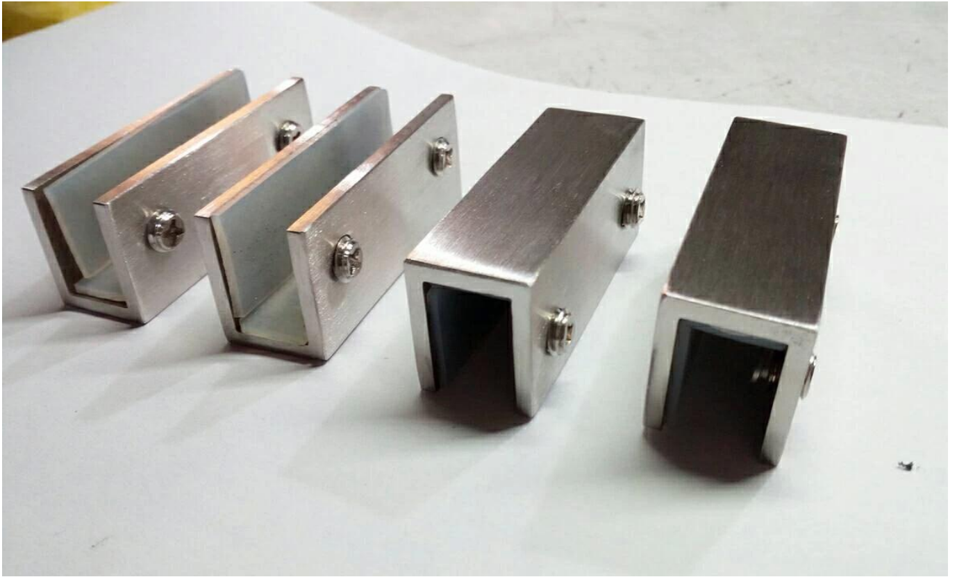
top view for 180 degree glass clamp