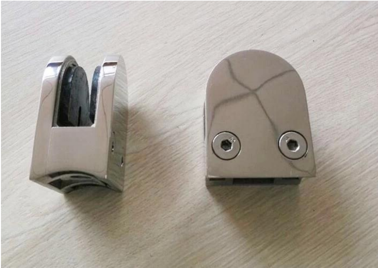
2. Round shape glass clamp project FYI: