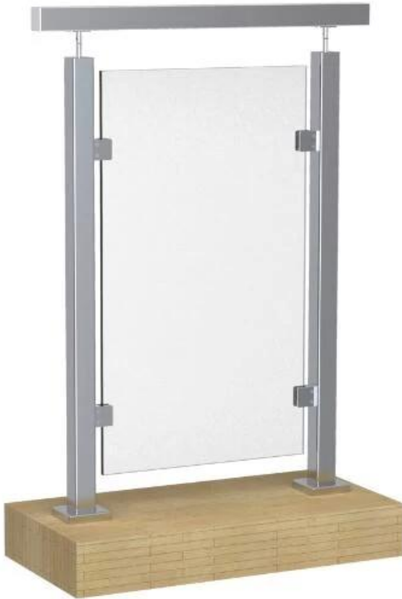
Side mounting type,