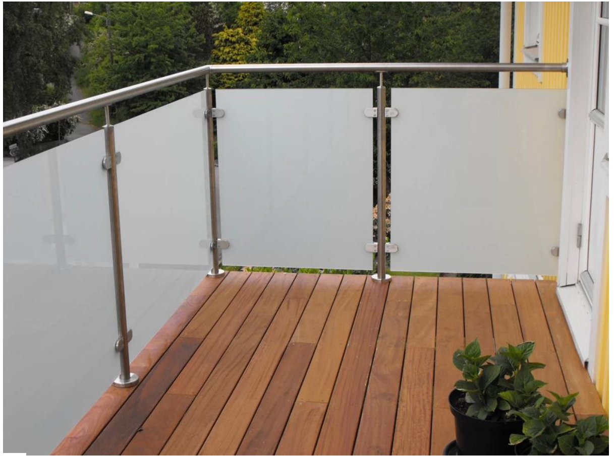
2) stainless steel balustrade post glass railing balcony railing design with clear

3. stainless steel balustrade post glass railing balcony railing design projects, 1) stainless steel balustrade post glass railing balcony railing design with frosted glass design,