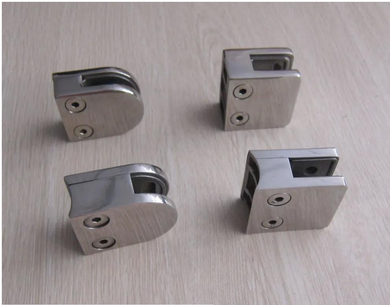
Square shape glass clamp project FYI: