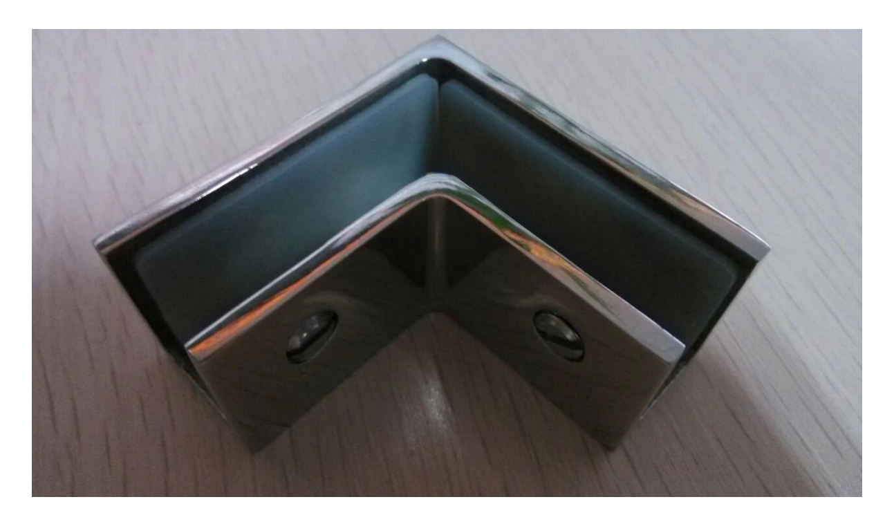
\underline{\text{Model BC-80x35}} glass clamp is used for middle of glass panel to strengthening railing system.