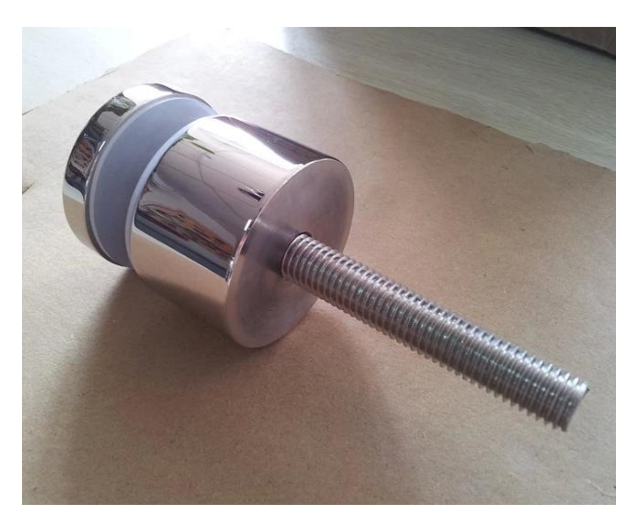
Thanks for your visit, Any interested or needs, please kindly contact with me freely: