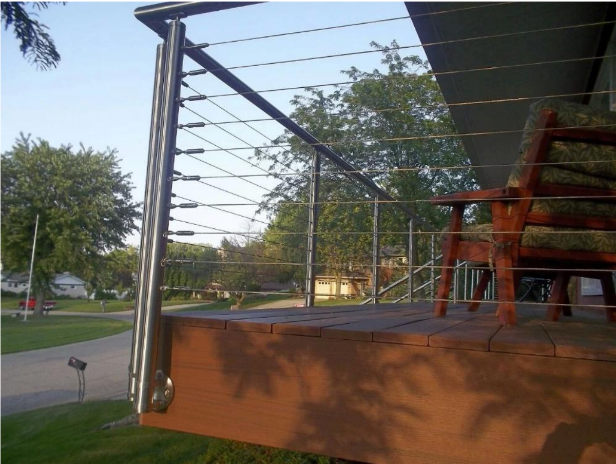
4. Square shape stainless steel post cable railing project : stainless steel cable railing design for outdoor deck,