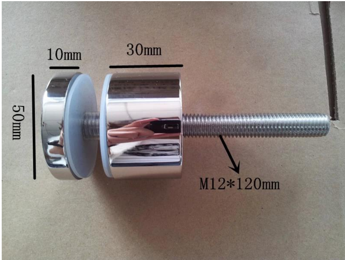
Model No.: SF-30