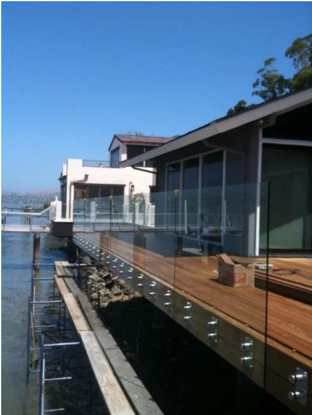
Single standoff is also available