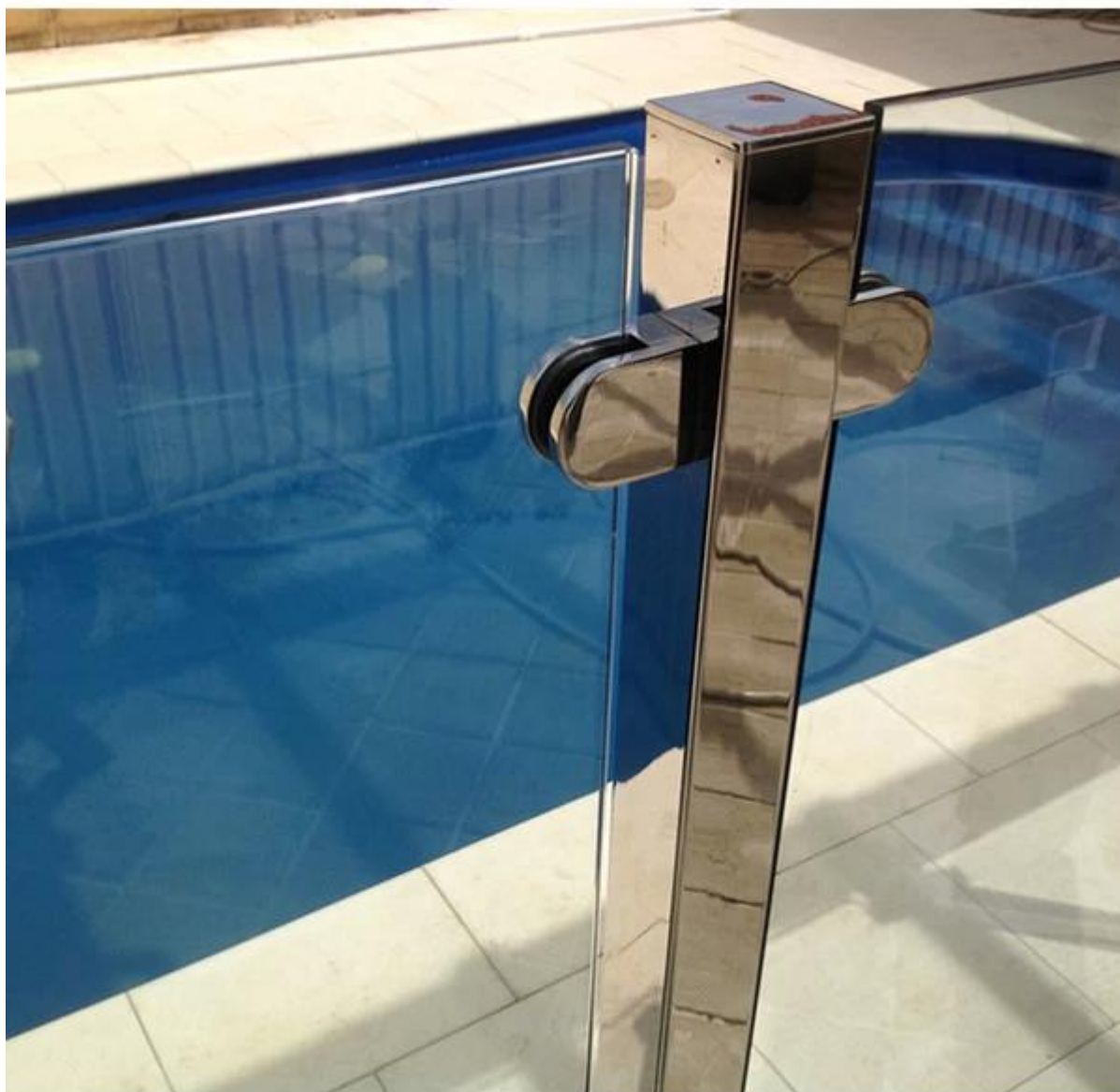
5.installation guide for glass clamp