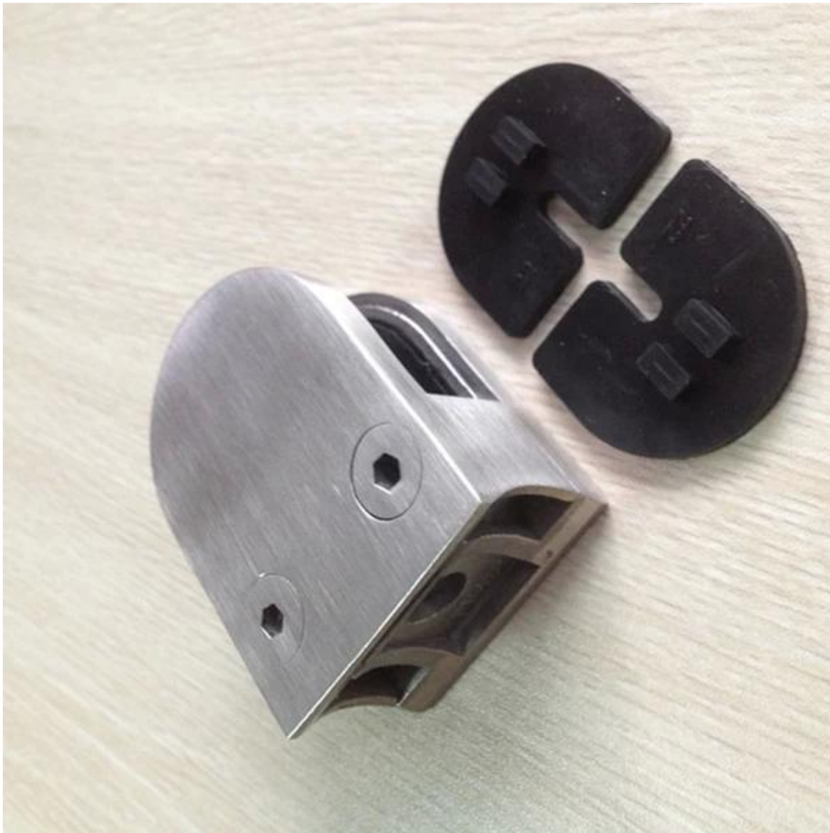
2.square shape glass clamp with flat bottom and round bottom stainless steel square type glass clamp for stair, stainless steel glass clamp with flat base for balcony handrail