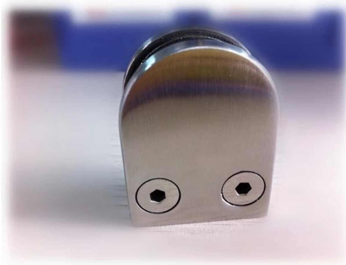
G104 glass clamp, flat

2.comparison between satin and mirror finish