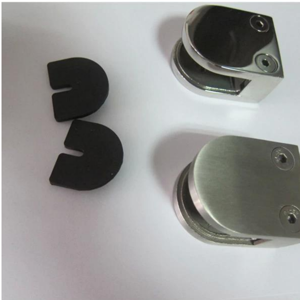
3. square type glass clamp in mirror finish for 8-10mm glass