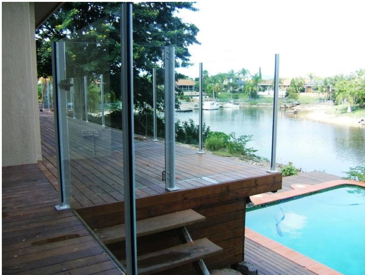
glass balustrade with glass standoff frameless stainless steel glass standoff for balcony, balcony design stainless steel outdoor glass standoff