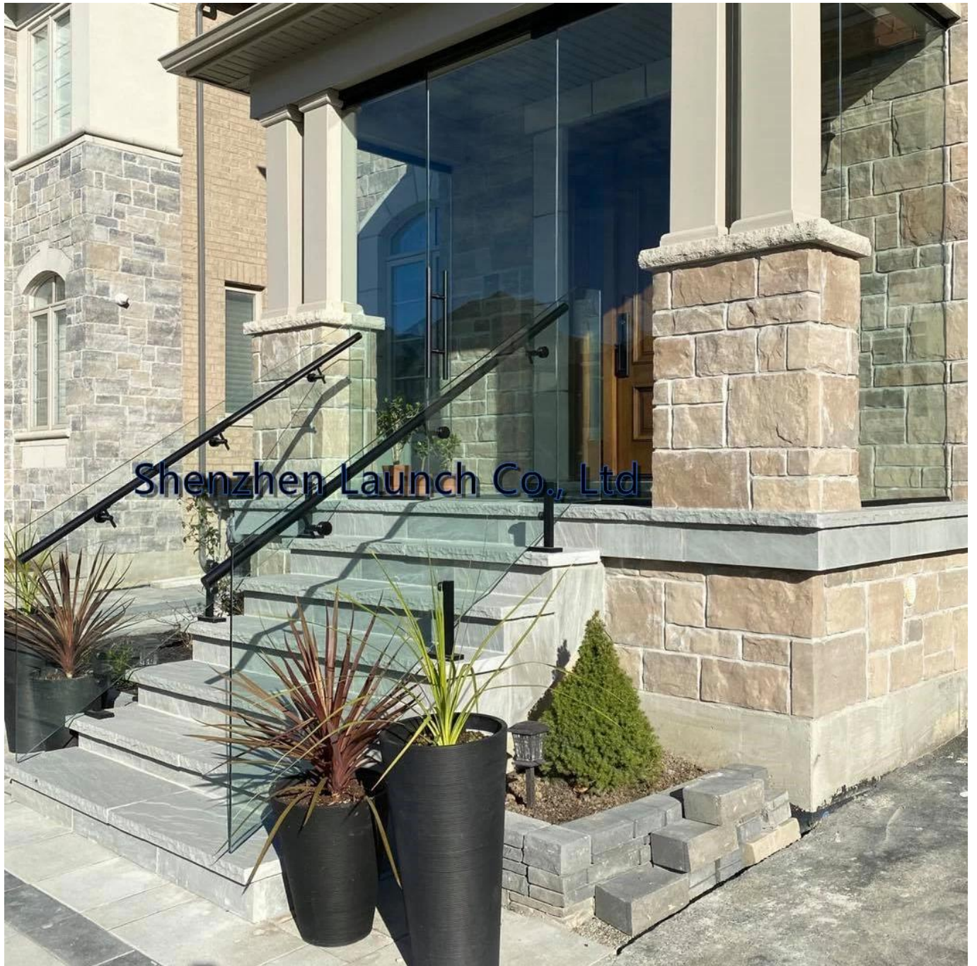
Wall mount handrail bracket , P708