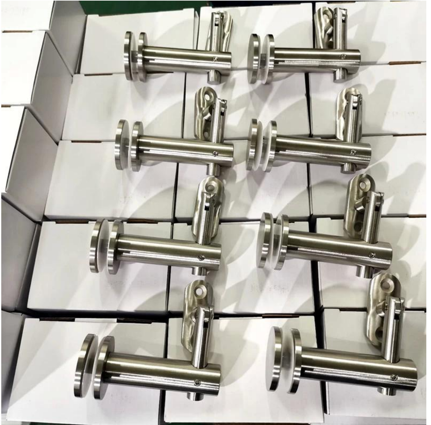
Glass handrail project photos -