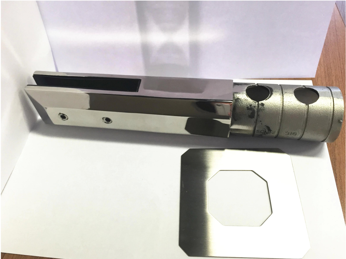
RCM-2 ( round core drill spigot)