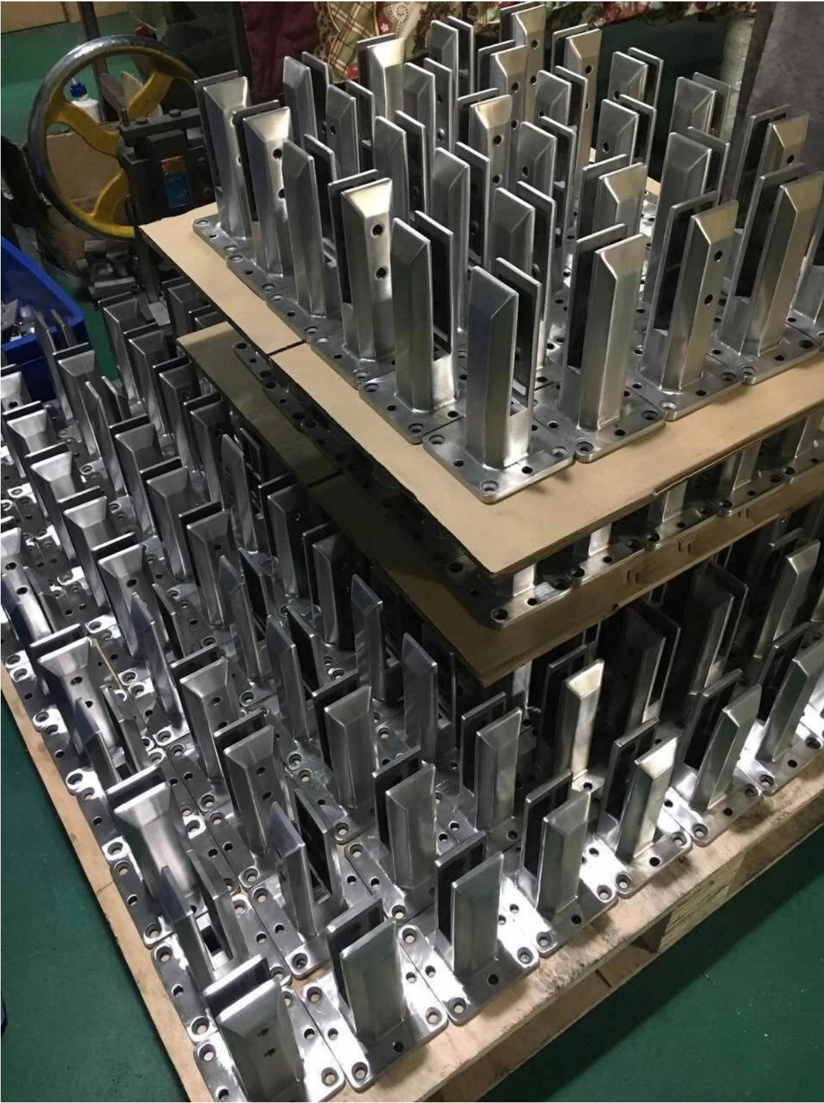
Glass spigot package: