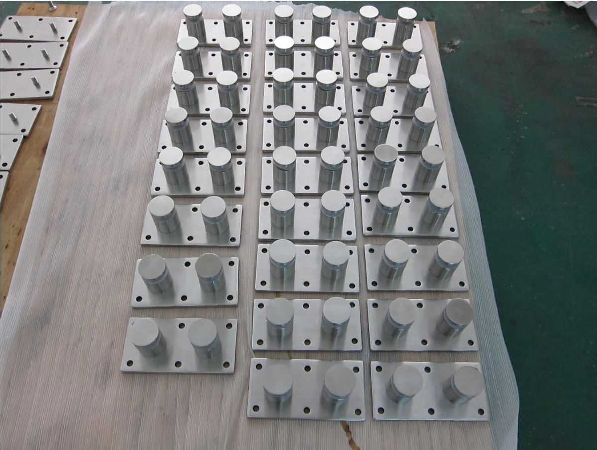
3. stainless steel glass standoff glass stair case photos .