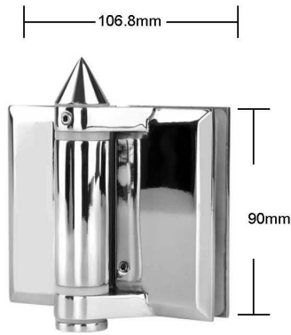
Part # G-G

Spring can be adjusted for closing speed control .