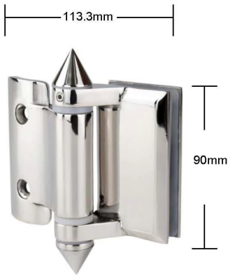
Part # G-R