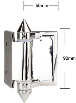
Part # G-W