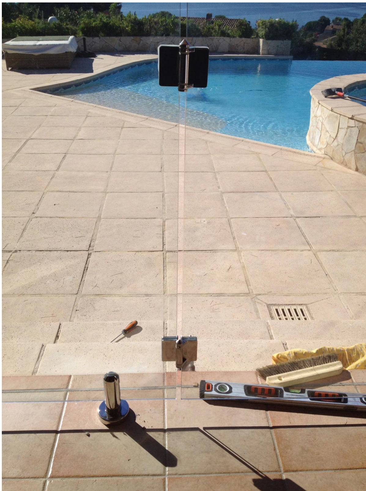
3.glass latch stainless steel glass door latch for 8-10mm pool fence, stainless steel glass door hinge and latch china manufacturer