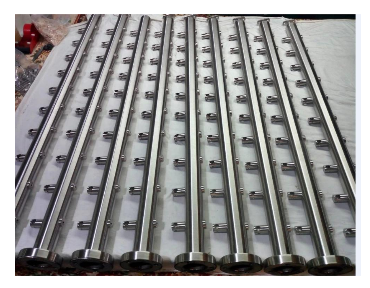
(3) Side mounting balustrade post