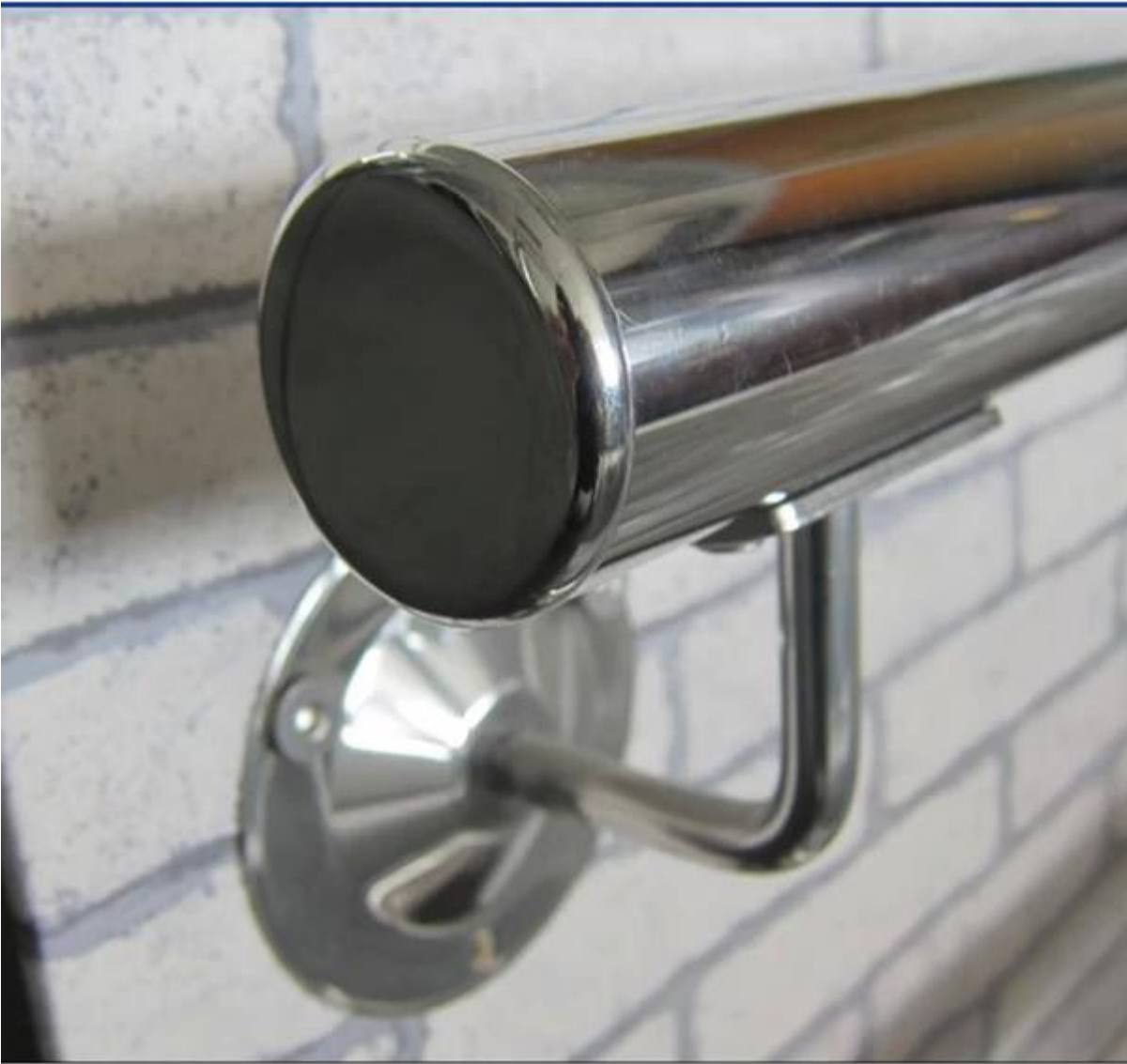
stainless steel post handrail end cap