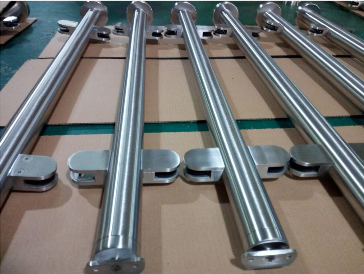
2 way post 90 ° or corner post .