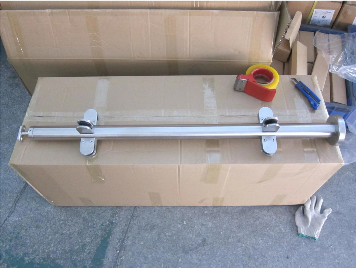
4. Glass balustrade project photos for your reference ,