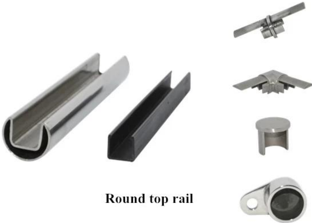
Round top rail