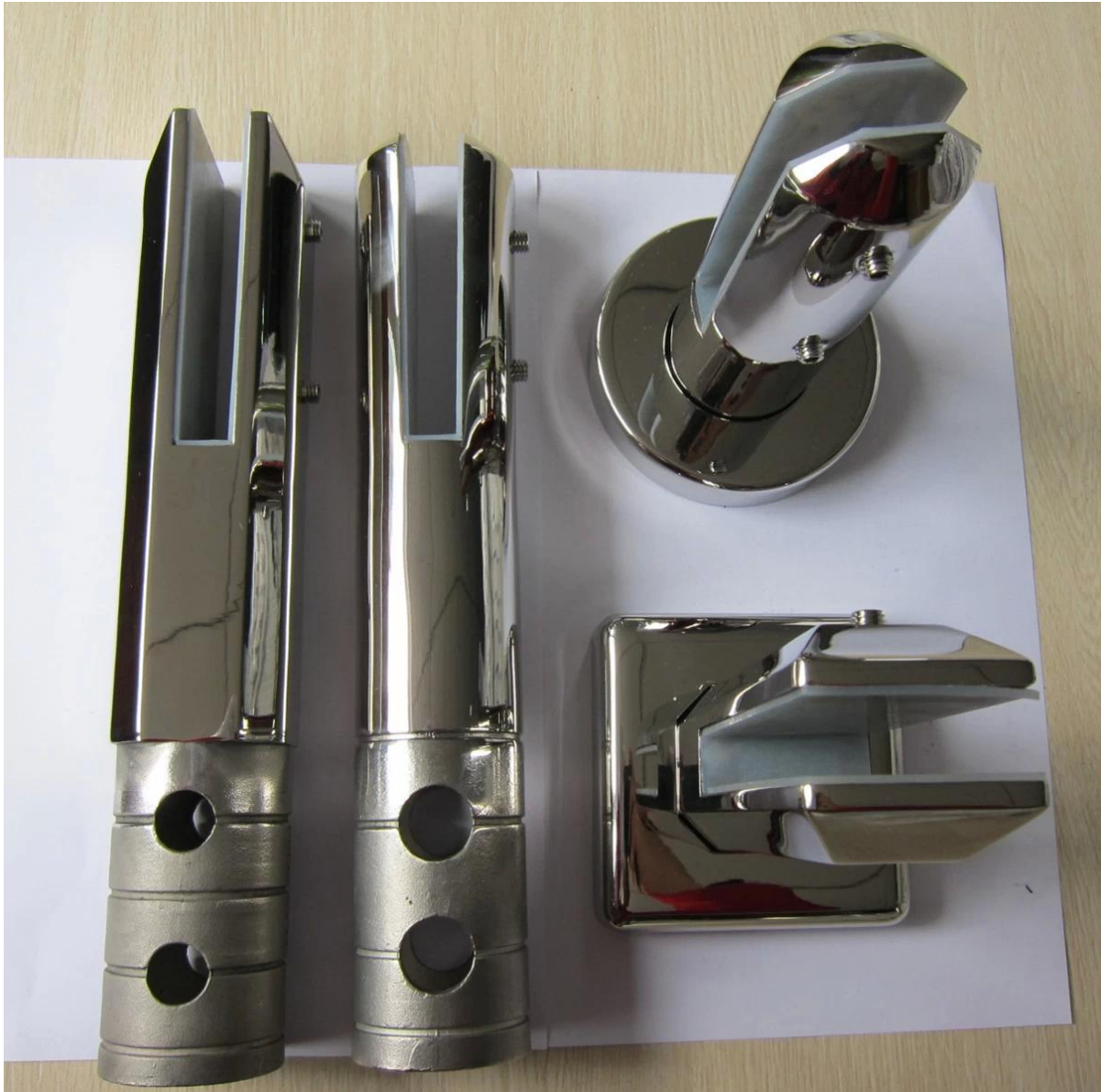
Project Photos for your reference□