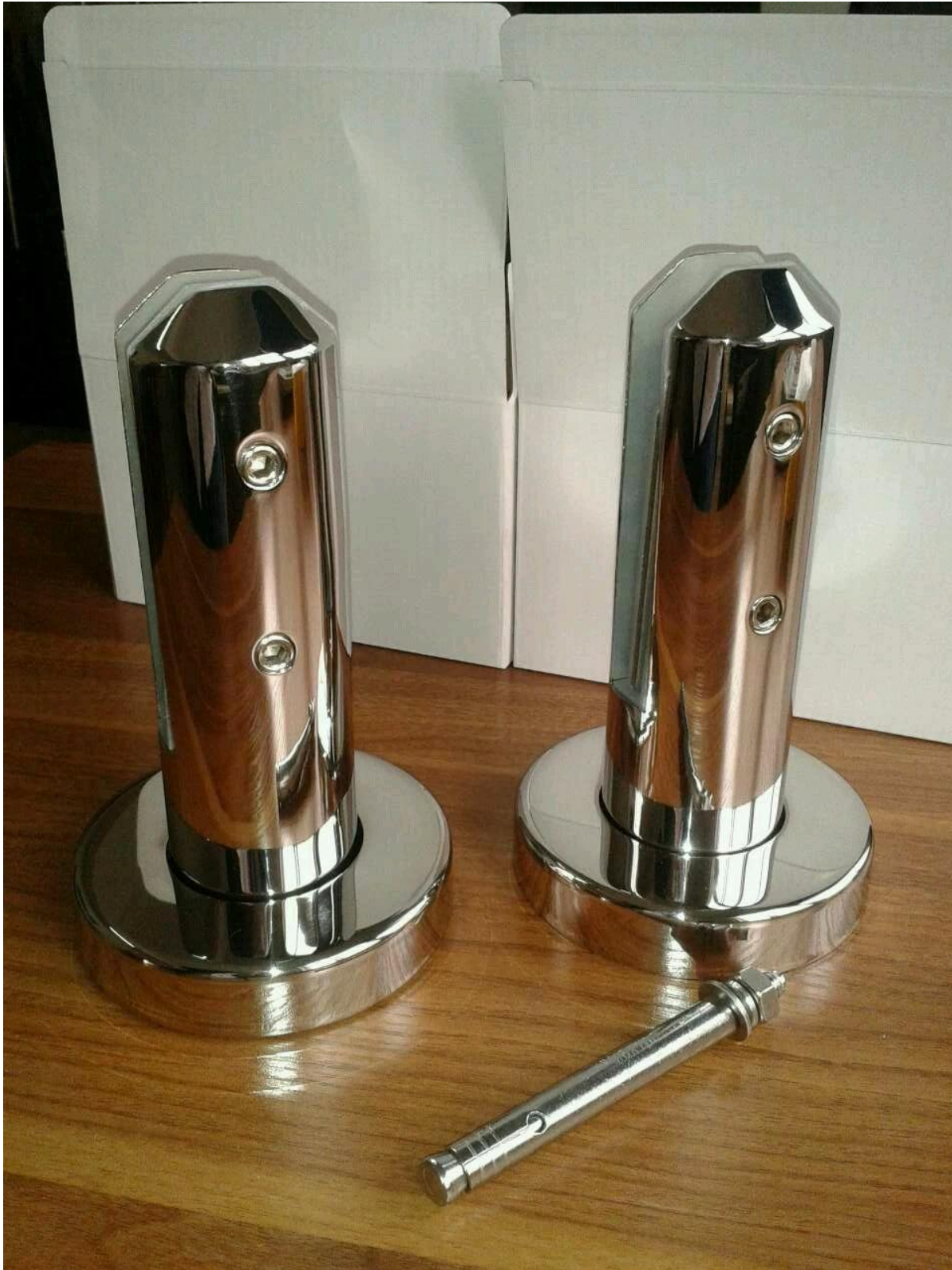
2). Round base plate spigot mass goods photo.