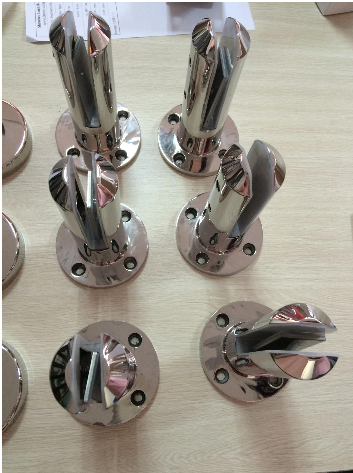
3). Round base plate spigot packing photo.