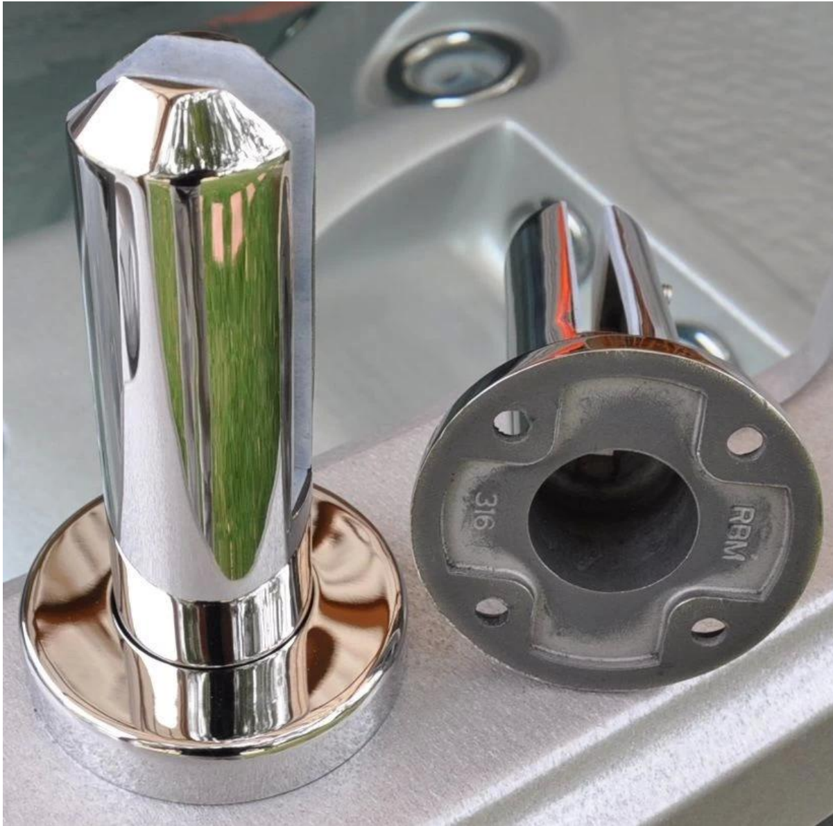
2). Round base plate spigot mass goods photo.