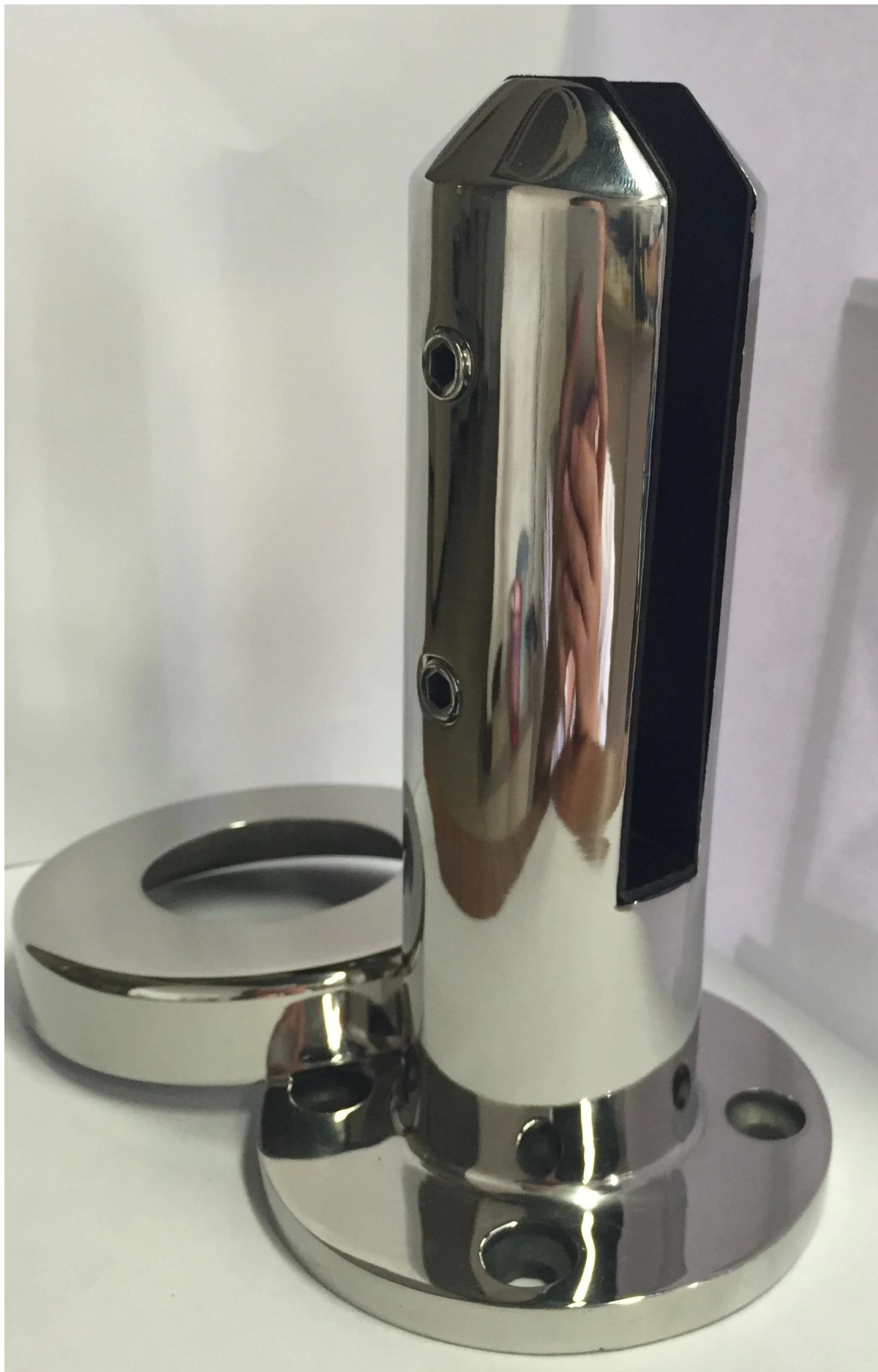
Model No.: RCM-2