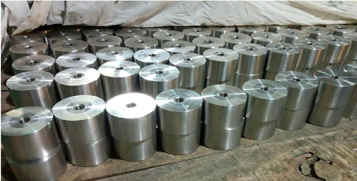
2# Model: Diameter 50mm x 44mm Long Base Standoff