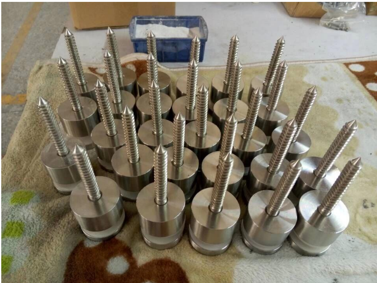
2. 2" stainless steel standoff in frameless glass staircase glass