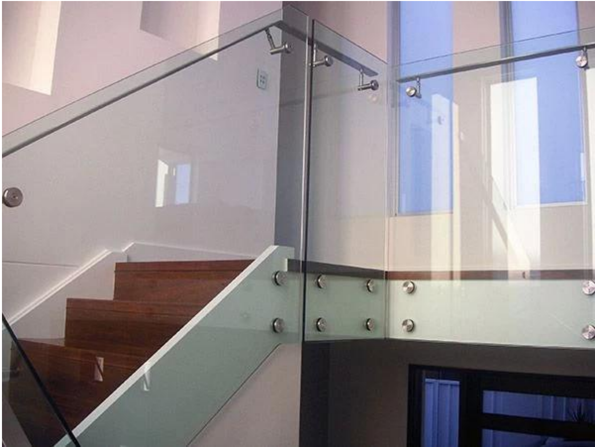
3).Stainless steel glass panel mounting brackets indoor corridor glass railing design.