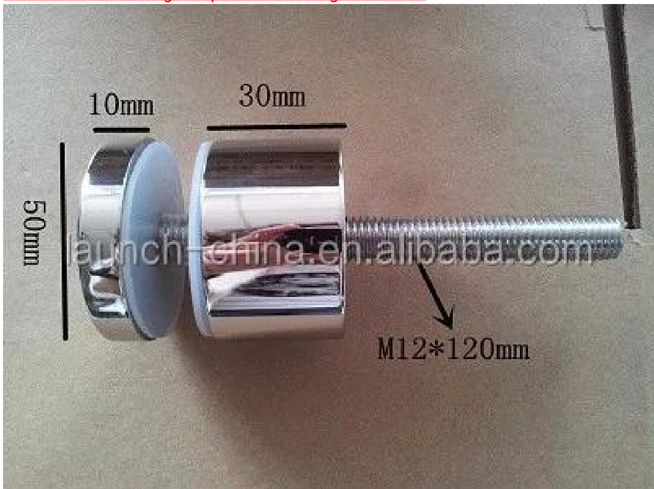
3. Model No. SF-50T glass panel mounting brackets .