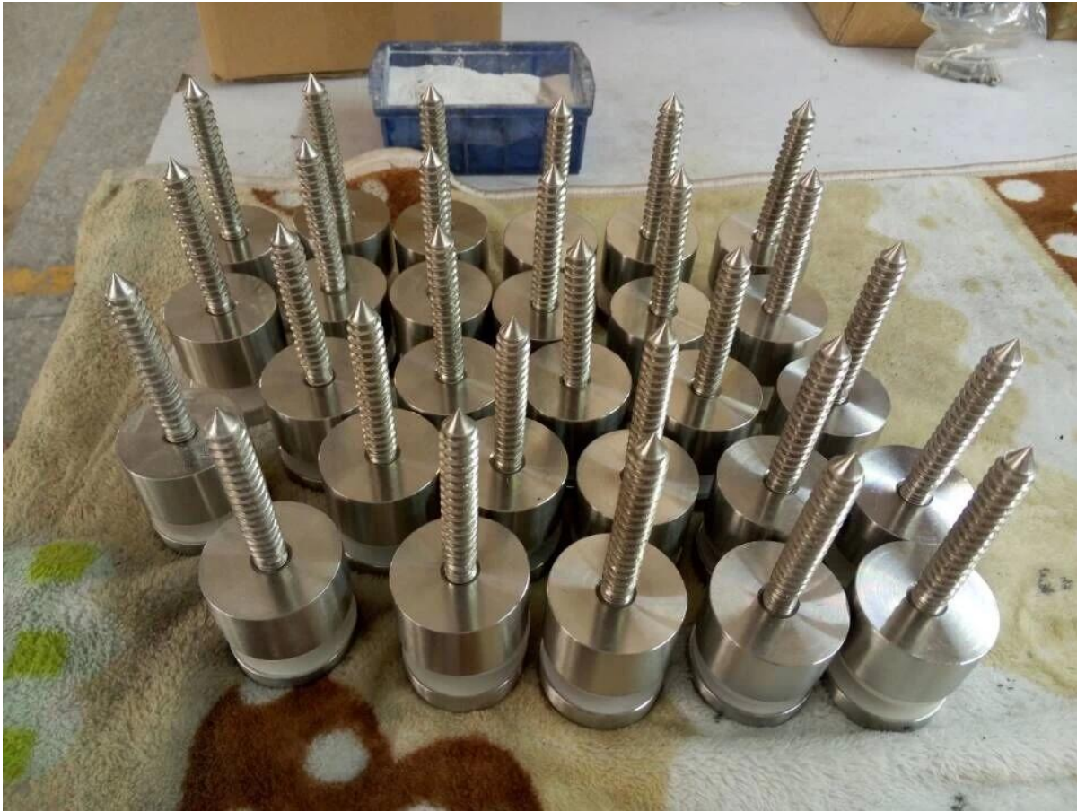
Concrete screw type.