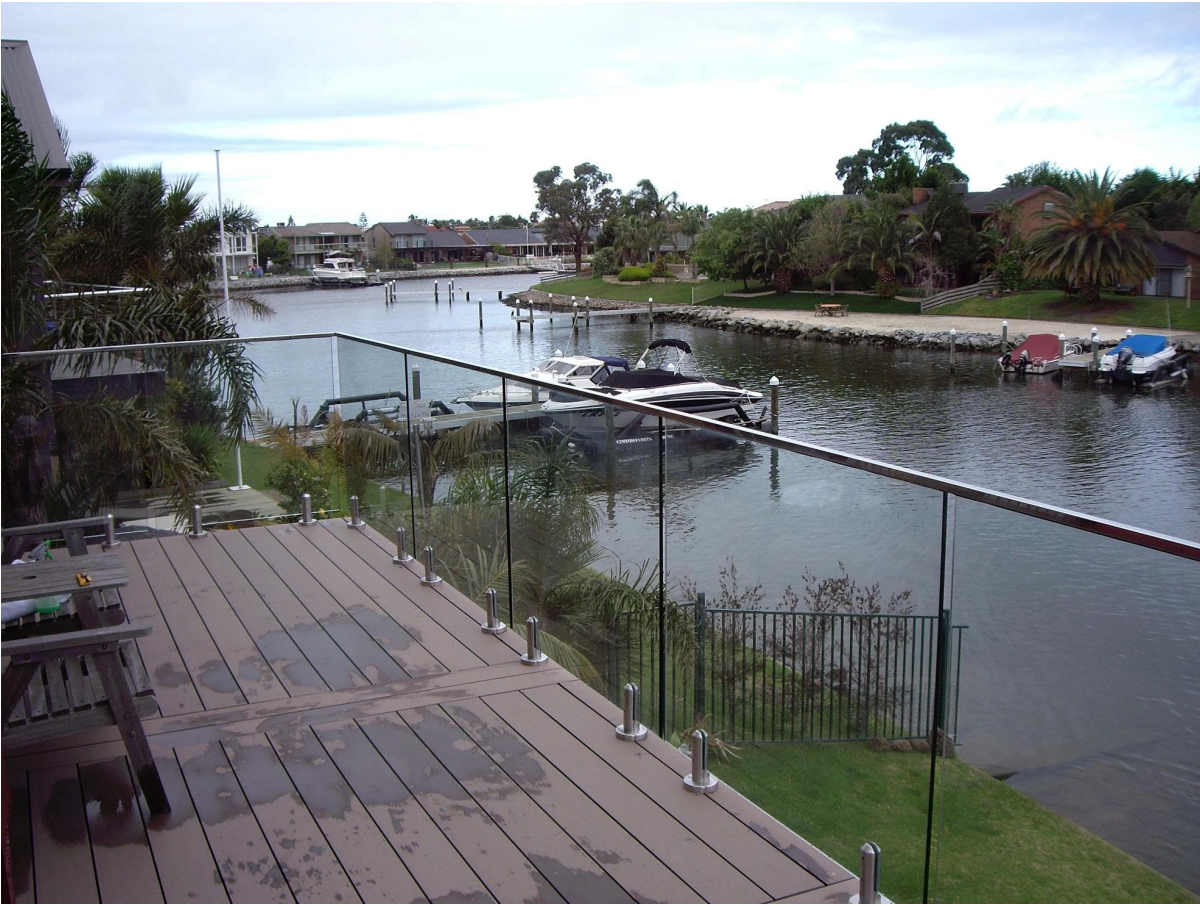
3). stainless steel top rails indoor glass railings: