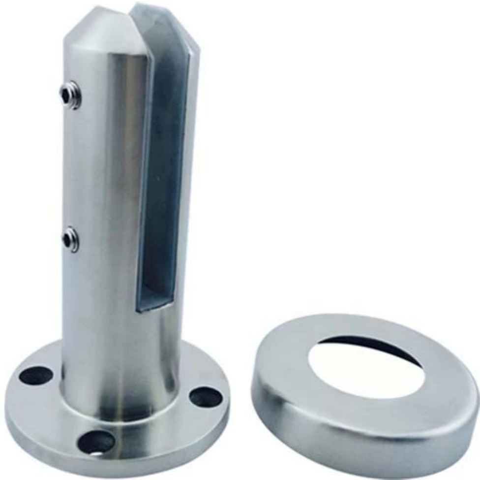
Model No.: RCM-2